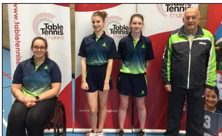
Team of the Weekend Cippenham B

Please visit https://british/ttleagues.com for fixtures, results and player statistics