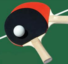
TABLE TENNIS CENTRE

Derbyshire Sports Club of the Year for 2010 and 2012 Announces