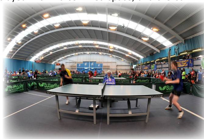
Table tennis is a safe sport to play indoors. It can be played within a confined space, and the ball will not break fragile objects. None the less, measures need to be taken to ensure that the activity is safe for the participants and other individuals in the proximity of the playing area. This section will be broken up into two sections; social table tennis and formal table tennis because the two variations each require a different set up.