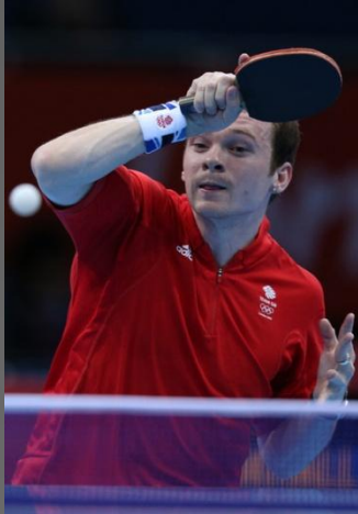
London 2012 Olympian Paul Drinkhall