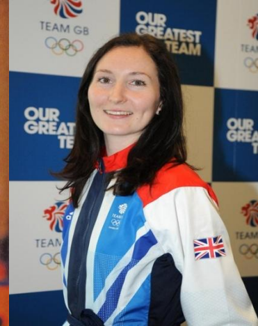
London 2012 Olympian Joanna Drinkhall

The Charity Table Tennis Exhibition Night is to raise money in support of a number of local table tennis players who have been affected by Cancer. All of the money raised will be split between the following charities: