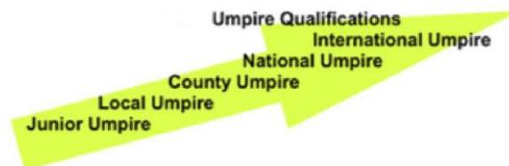
Table Tennis England

For further details please contact Table Tennis England at the address below: