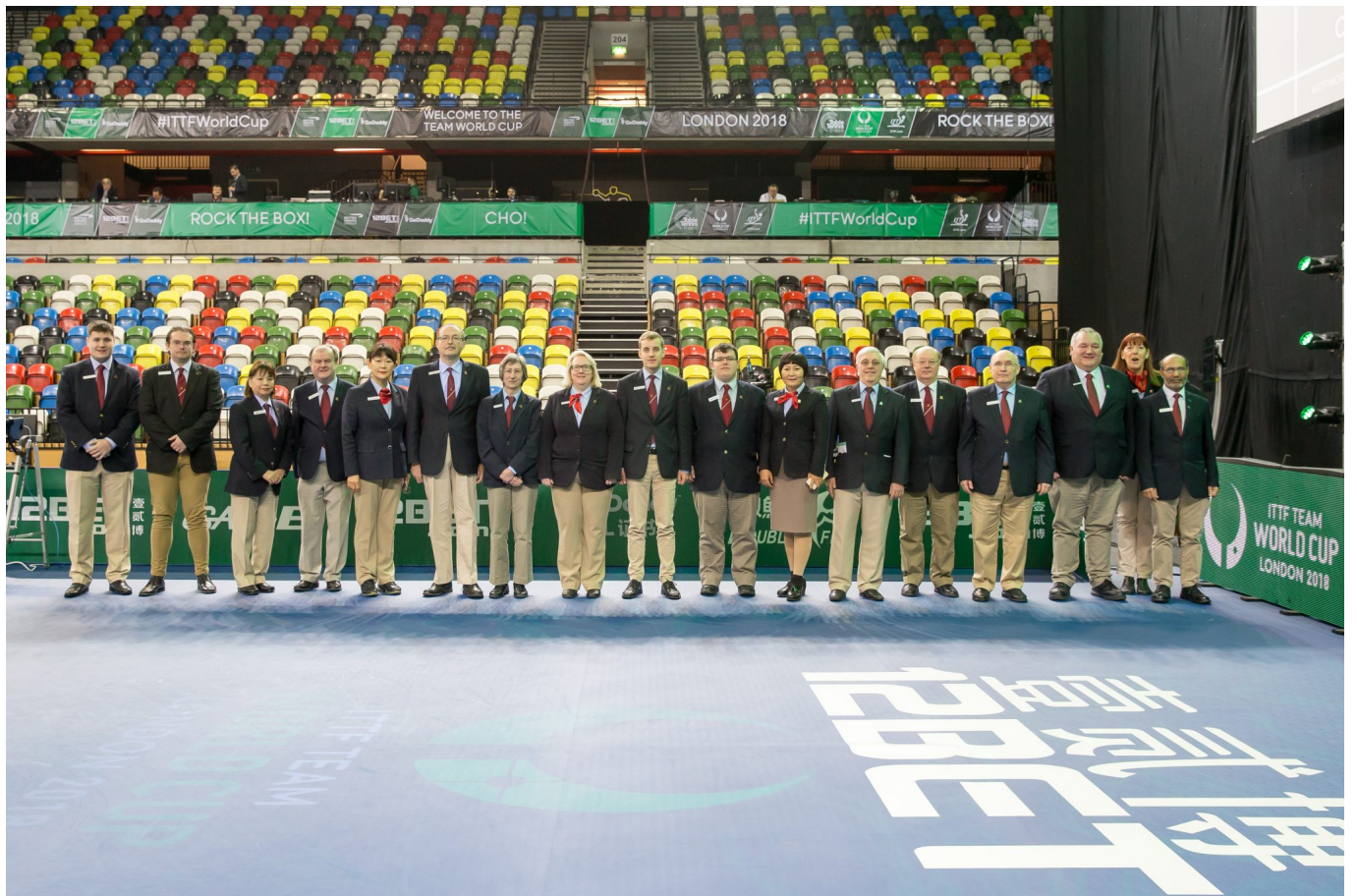
The Team World Cup umpires and officials