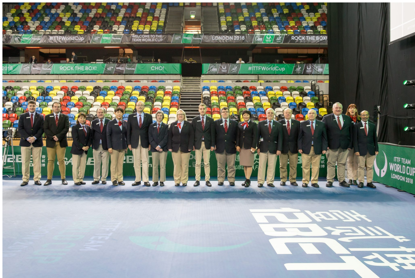
The Team World Cup umpires and officials