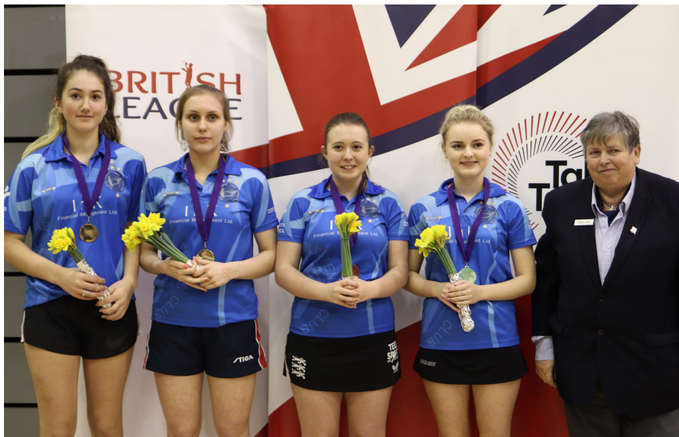
The Burton Uxbridge line-up which won Division 2