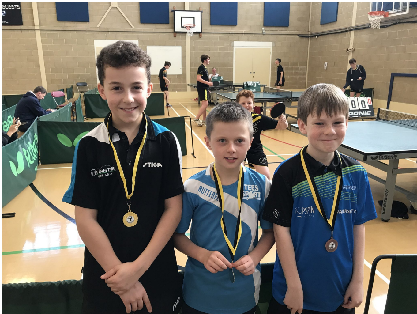
The top three in the under-14s