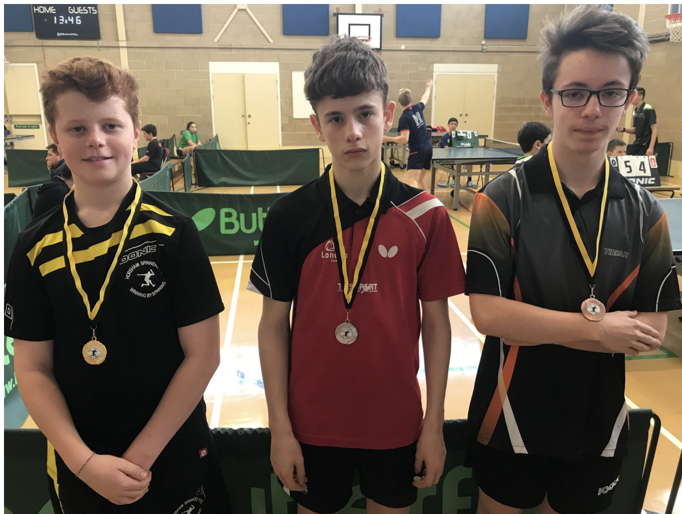
The under-16s with their medals