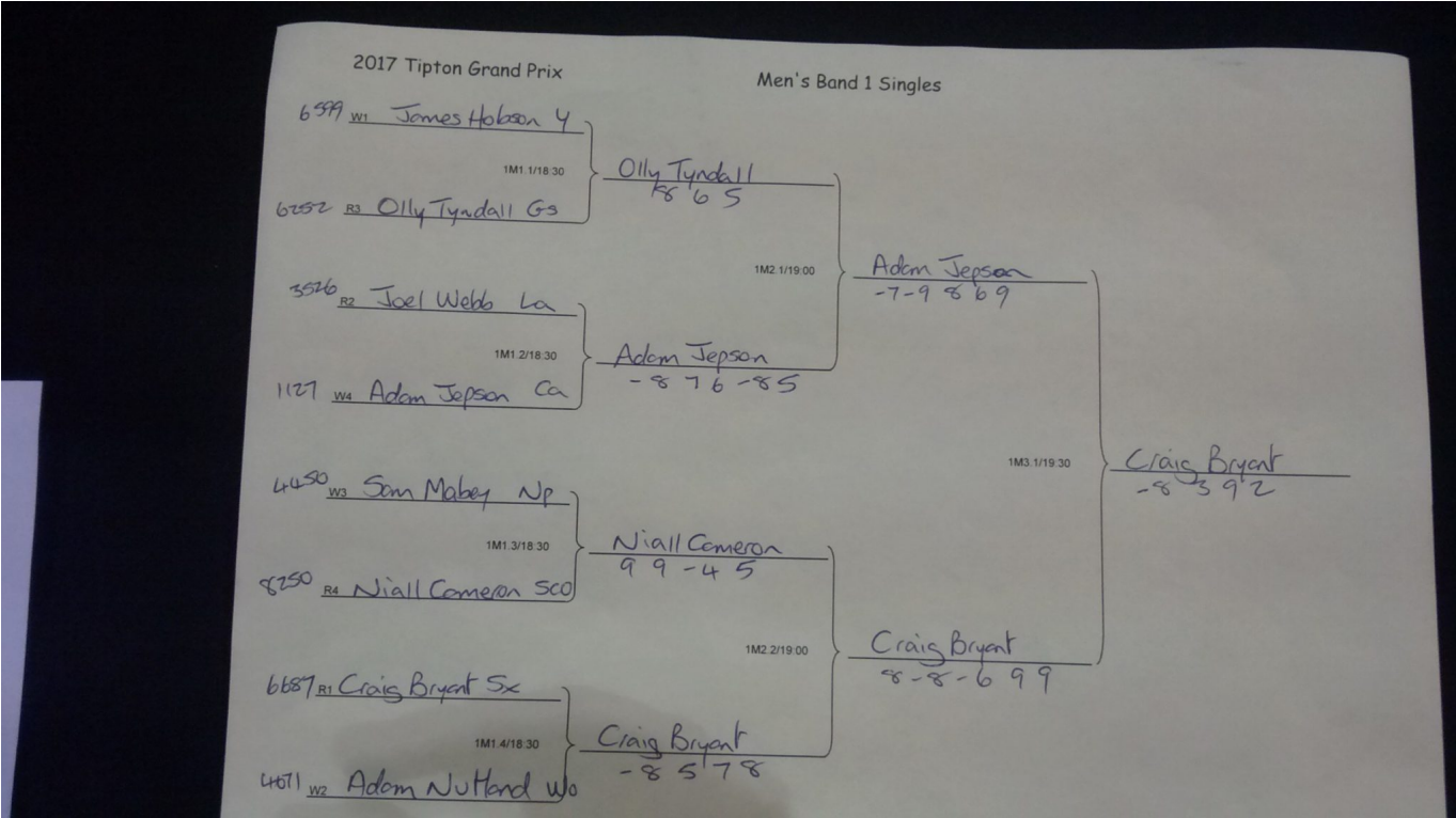
Men's Band 1 Results