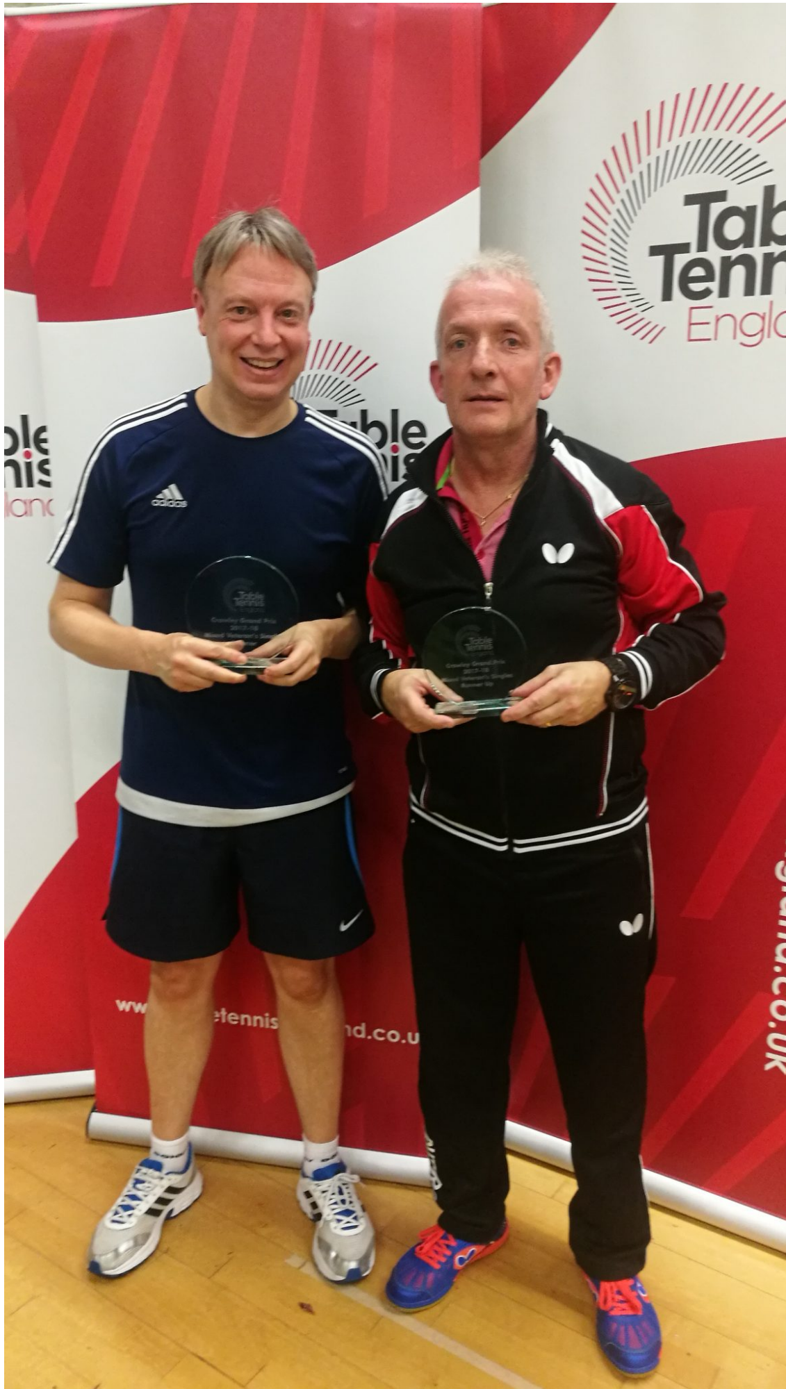
Table Tennis England