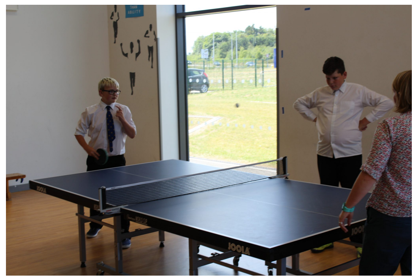
Action at Laleham Gap School

Among the wide range of organisations taking part were: Anglia Ruskin University, Osterley Park (National Trust), Mansfield Museum, Active Glos, various Ping! cities (including Barnsley, Nottingham, Plymouth, Exeter and Blackpool), Cornwall Sport, Leeds & York NHS PFT, Battle of the Paddle, Health@Work, University of Liverpool – Institute of Ageing & Chronic Disease, Blackstar Solutions, Shropshire Leisure, Energise Me, oxmeinfo, Prysm Group, Public Health England (NW), St Austell Printing, Active Cumbria, The Workstation (Sheffield), Phoenix Group.