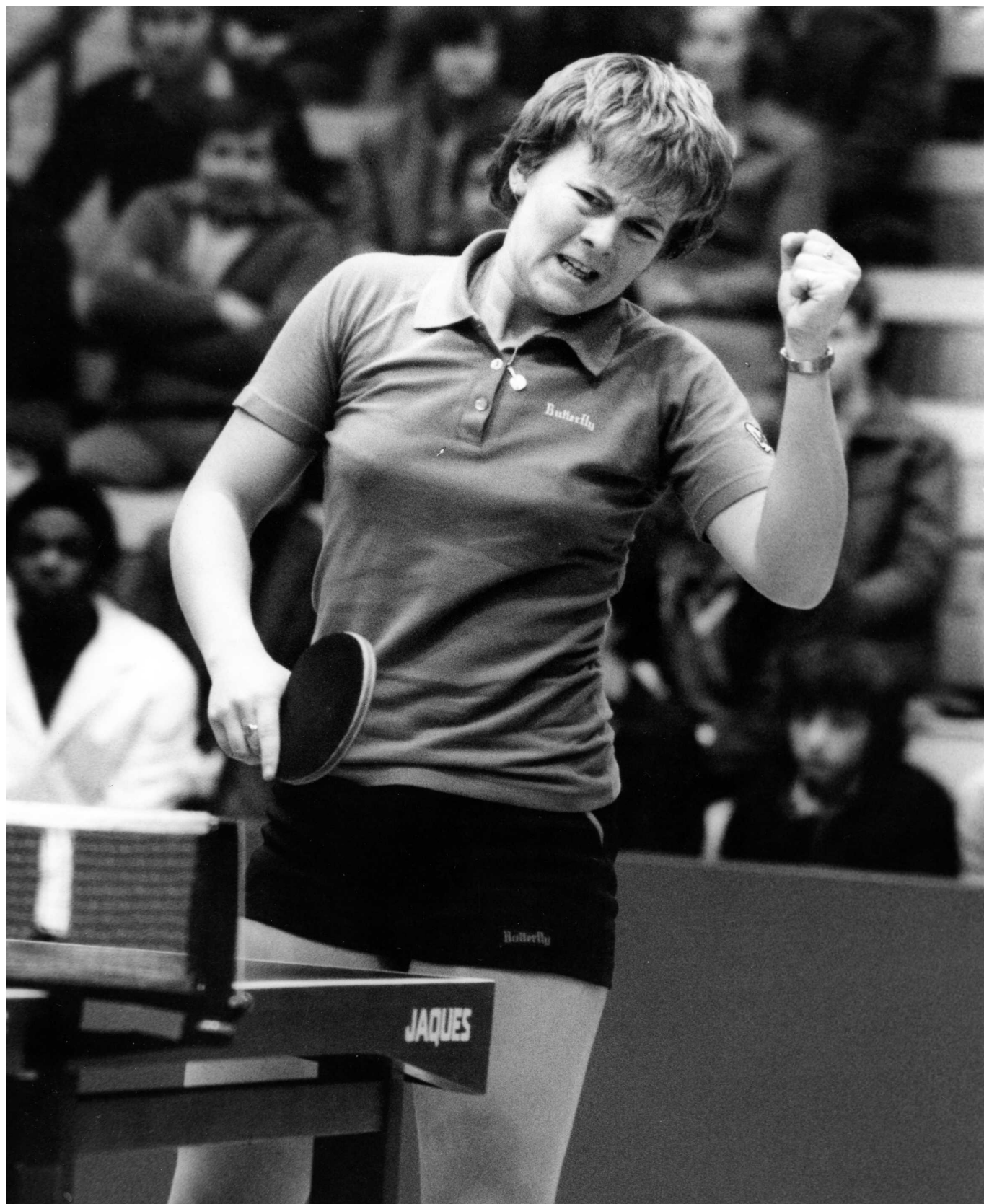
1981. A disappointed runner-up at the National Championships