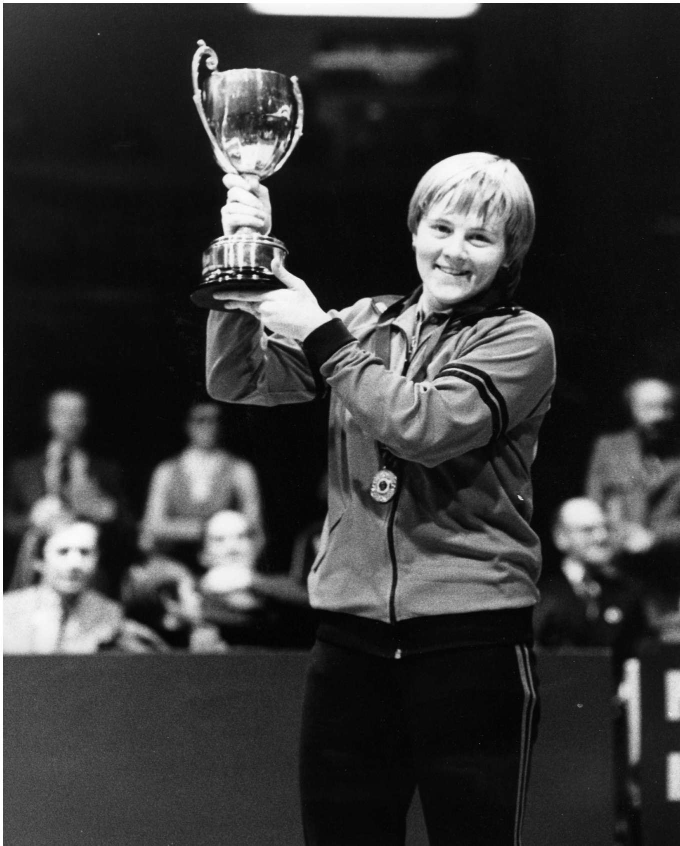
1980. National Singles Champion again