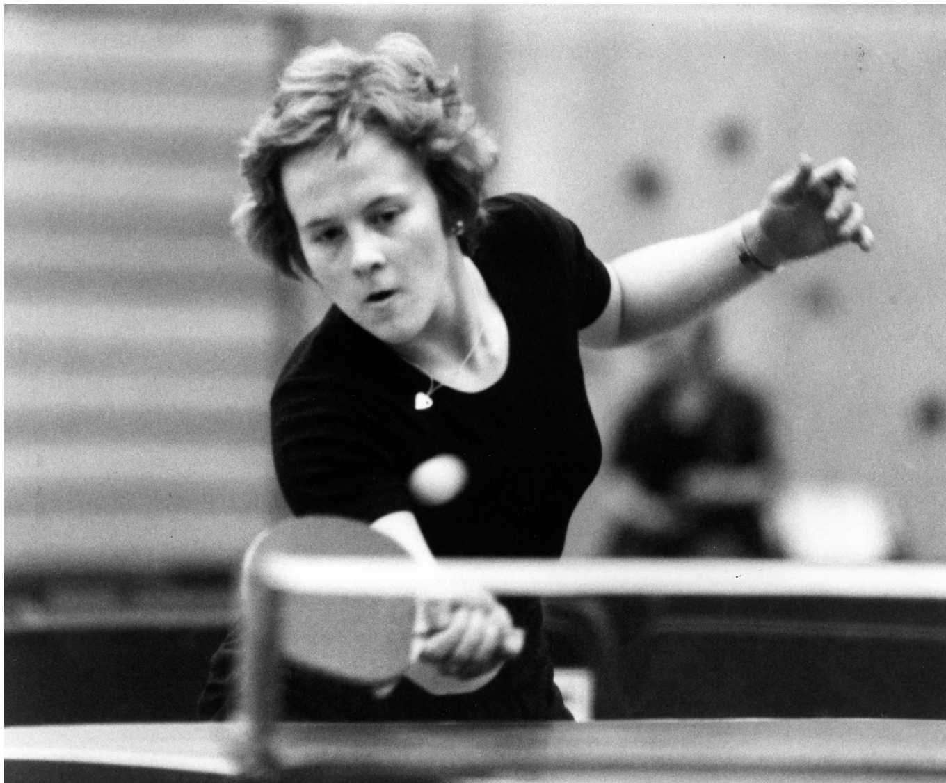
1977. Another action shot from the National Championships