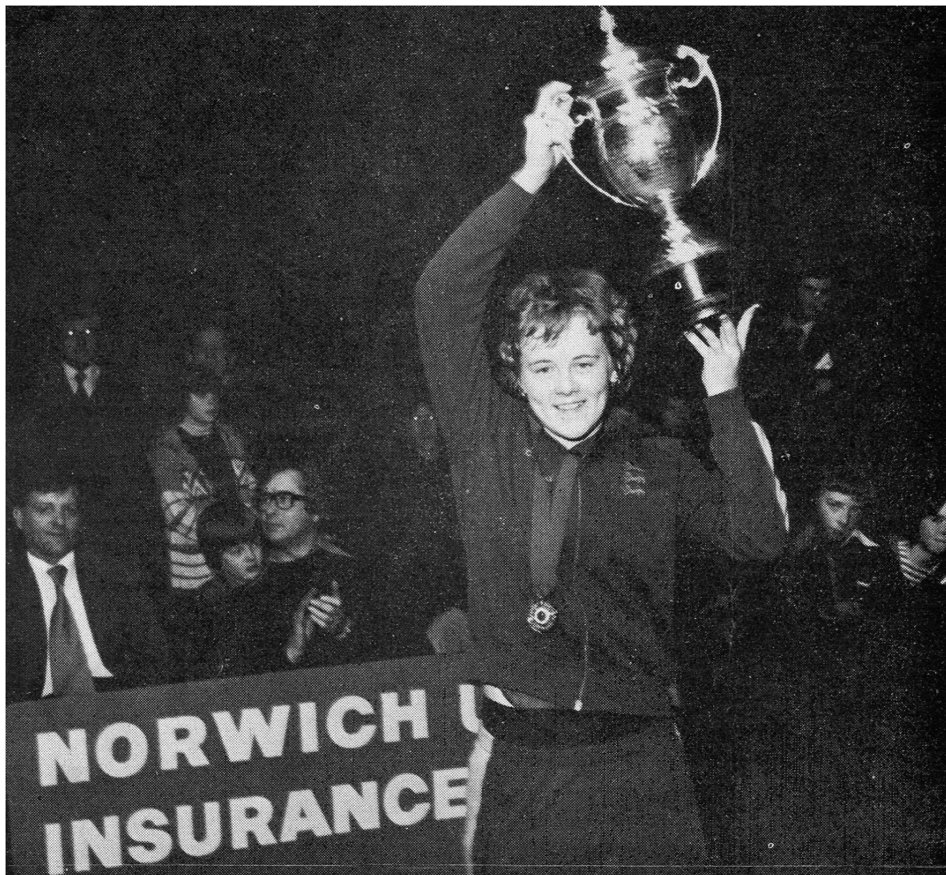
1977. English Open Women's Singles Champion