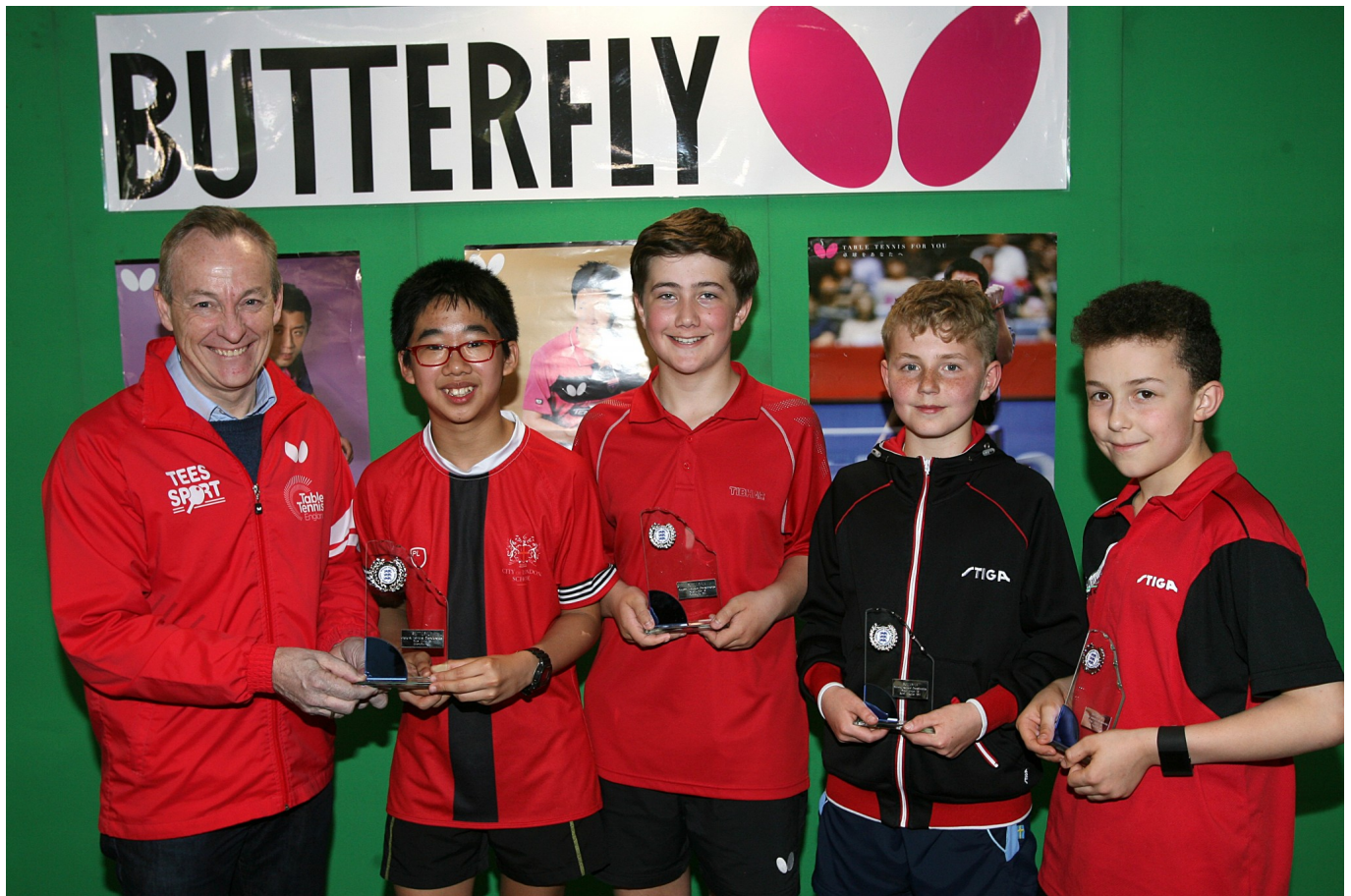
The Under-13 podium

The semi-finals saw McRae fight back from 2-1 down to beat Bertie Kelly 3-2 (11-4, 6-11, 7-11, 11-8, 11-9), while Hee saw off Stanley Shilton 3-0 (11-7, 11-2, 11-7).