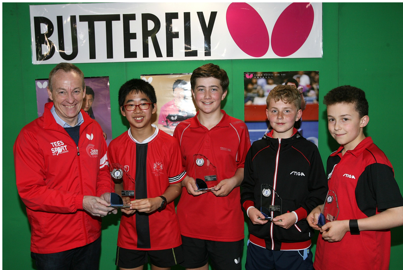
The Under-13 podium

The semi-finals saw McRae fight back from 2-1 down to beat Bertie Kelly 3-2 (11-4, 6-11, 7-11, 11-8, 11-9), while Hee saw off Stanley Shilton 3-0 (11-7, 11-2, 11-7).