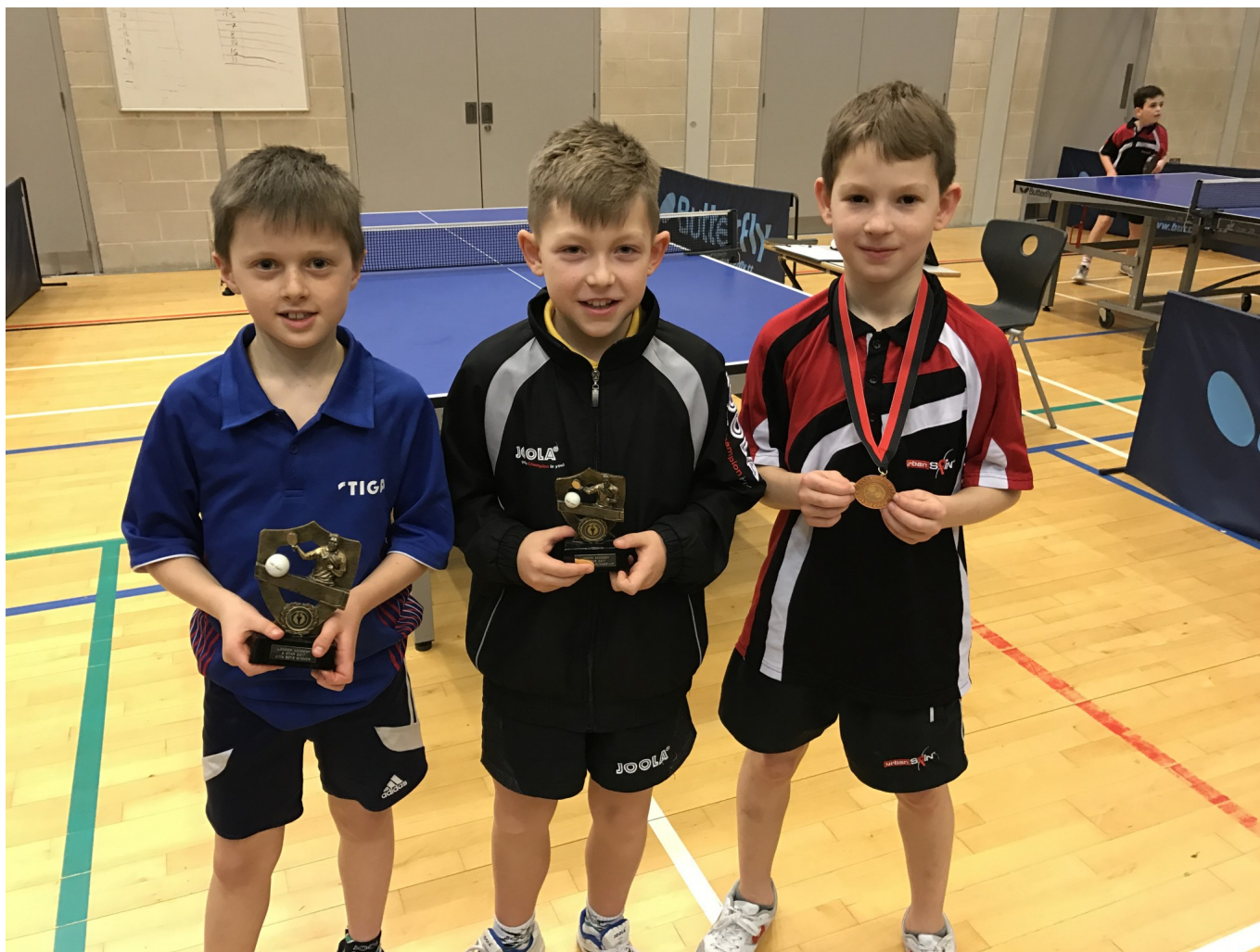
The under-11 medallists