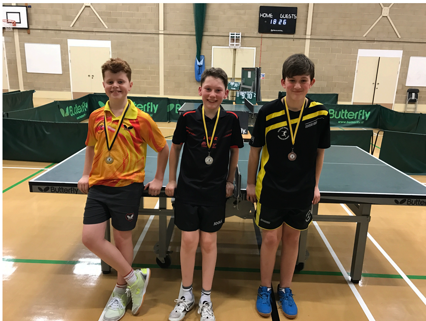
The top three in the under-14s