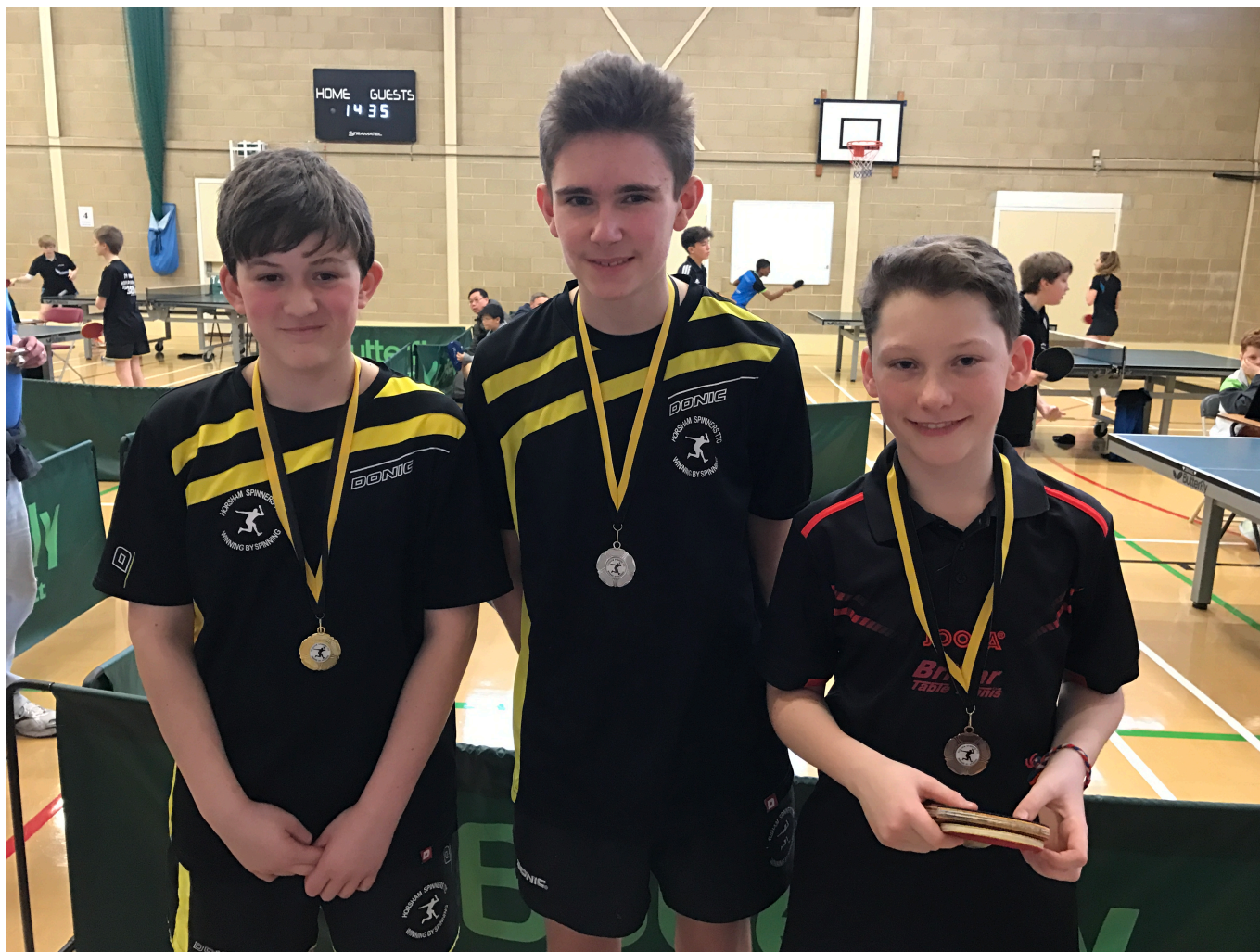
The under-15 podium