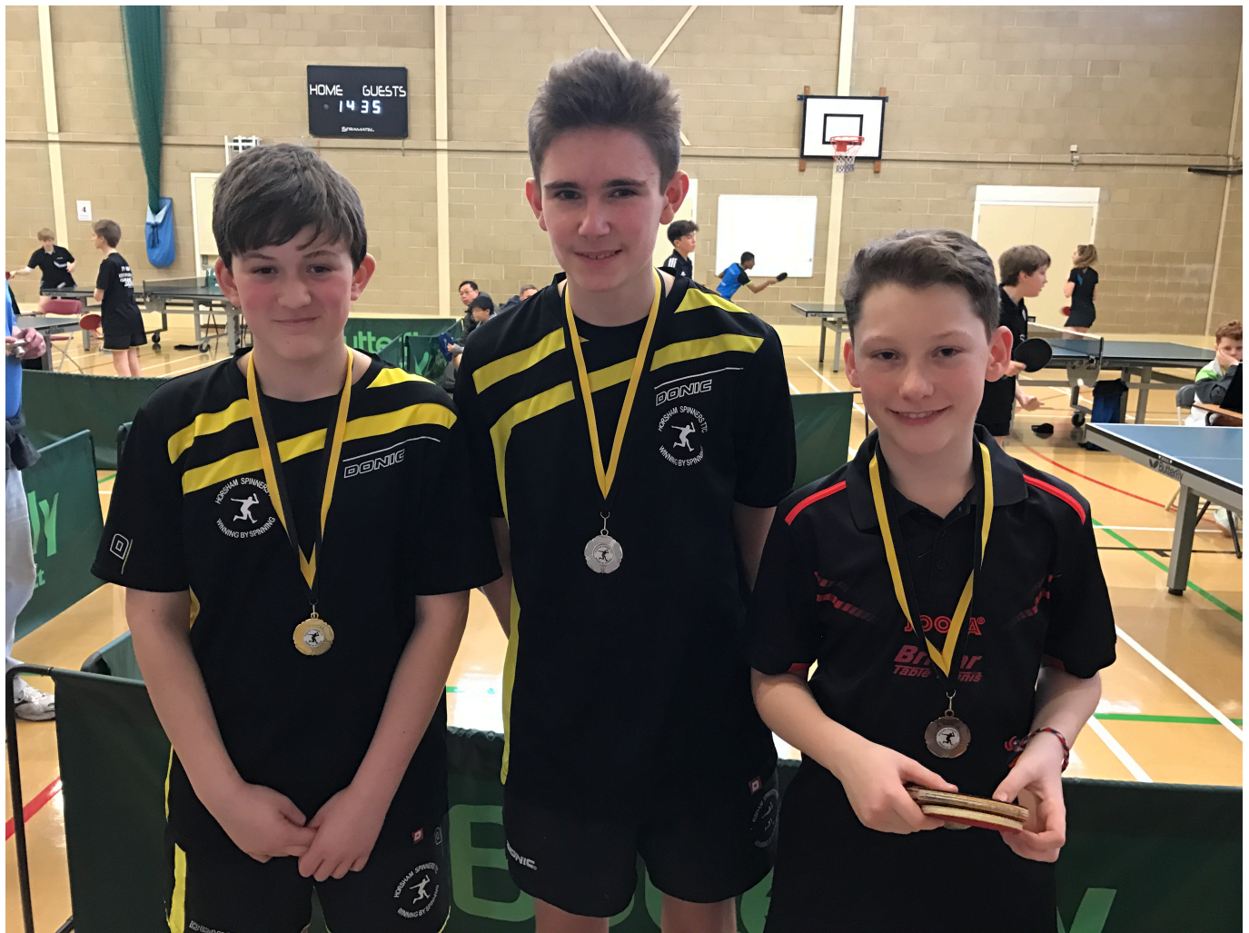
The under-15 podium