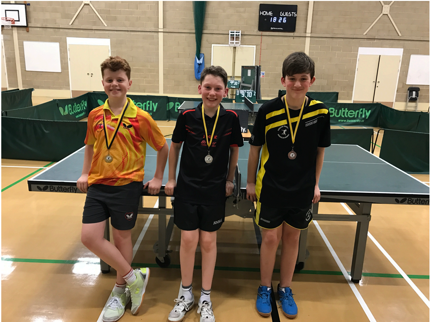
The top three in the under-14s