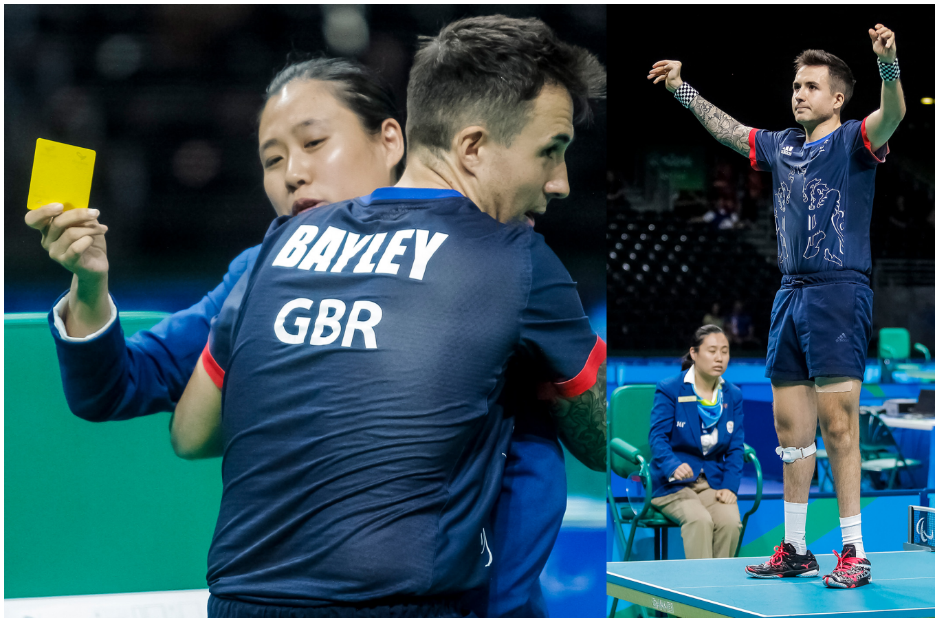
Will Bayley's memorable celebration after winning gold in Rio

The golden glow was doubled in Class 1, when Welshman Rob Davies overcame his Korean opponent to take the top step on the podium. And the medals did not stop there, with Bayley, Ross Wilson and Aaron McKibbin taking bronze in the Men's Team Class 6-8.