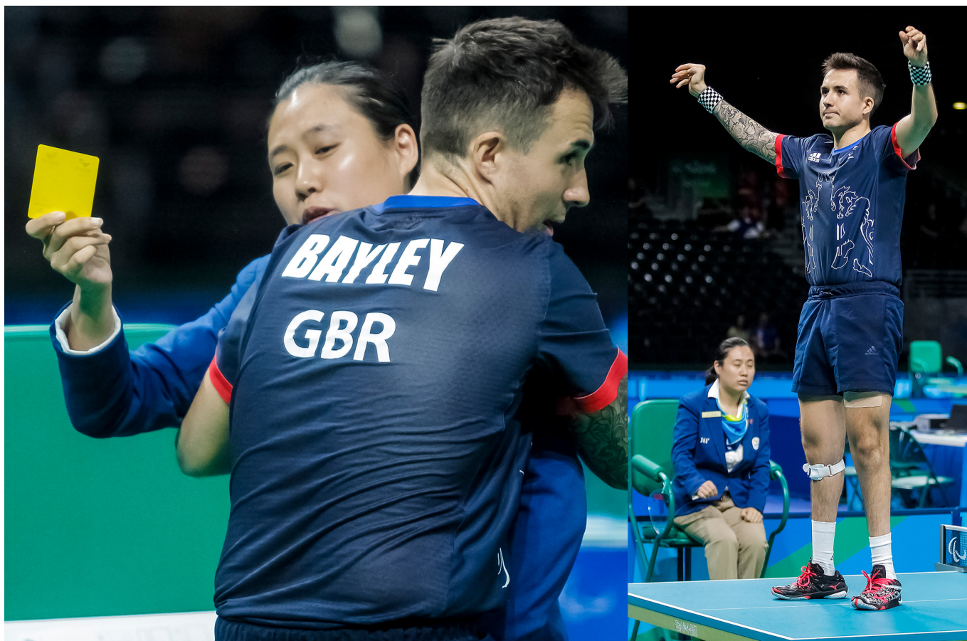
Will Bayley's memorable celebration after winning gold in Rio