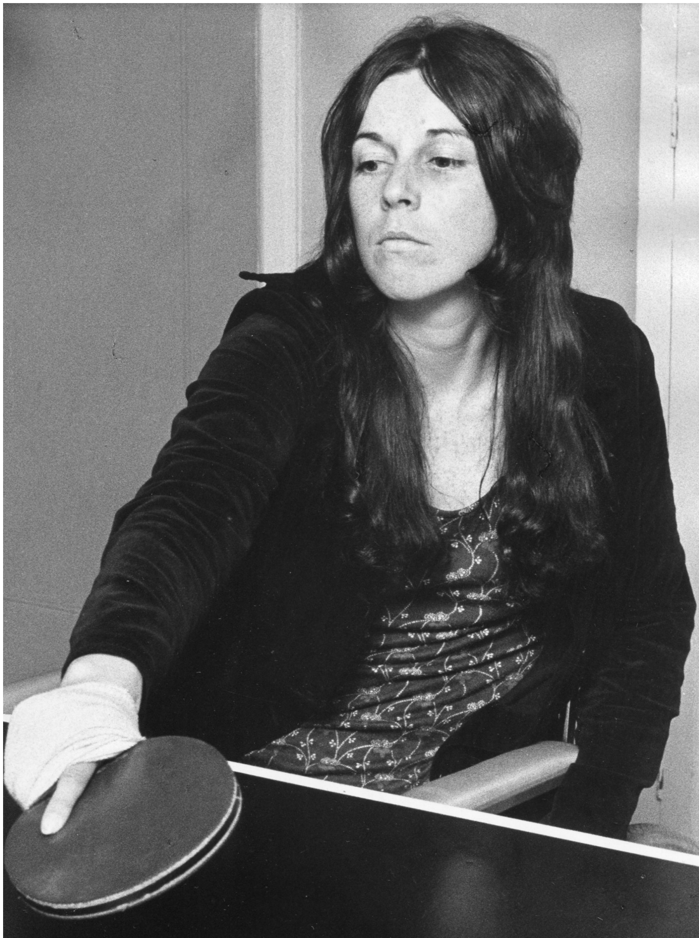
7. Unknown player.