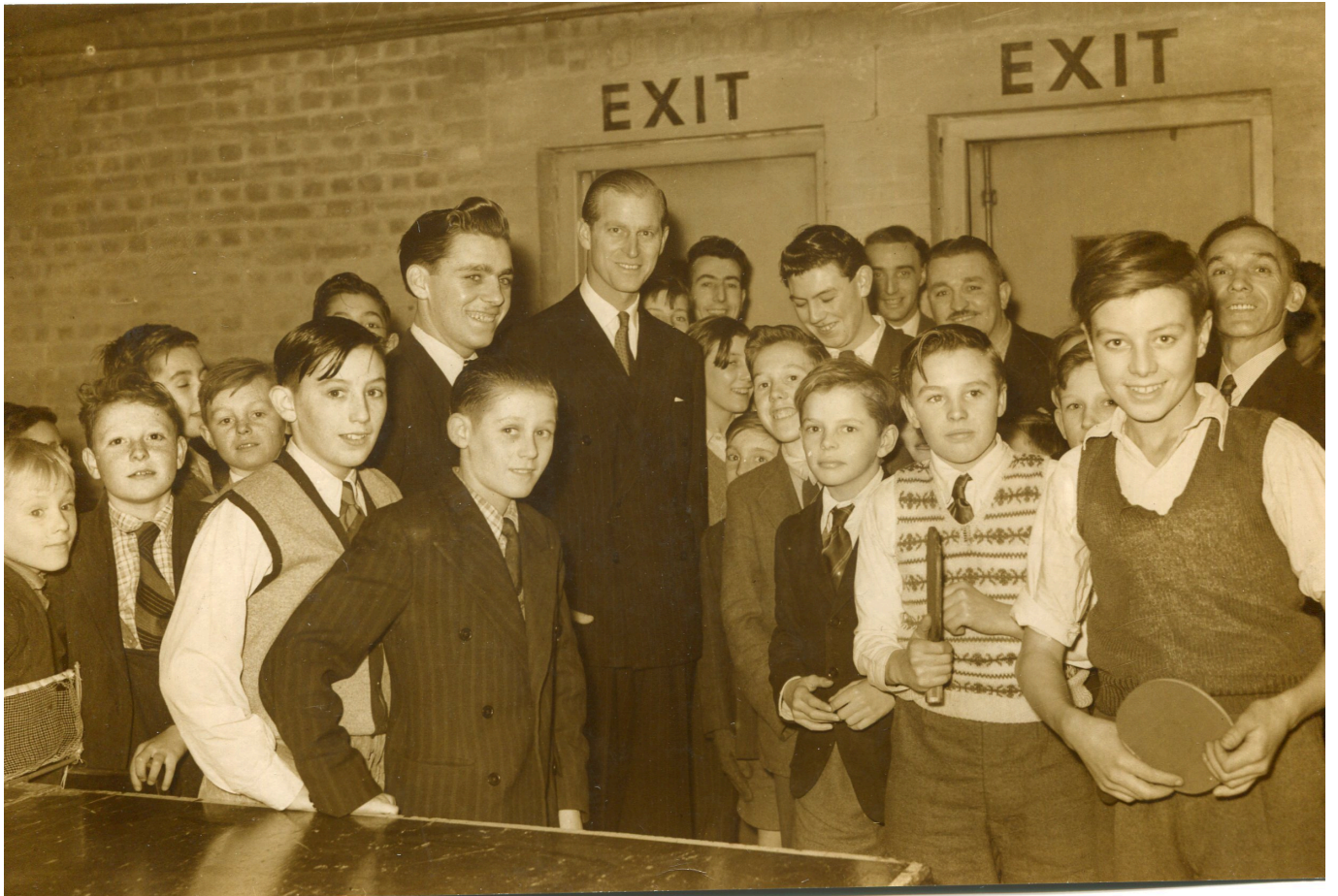
11. A real golden oldie of a young Prince Philip, Duke of Edinburgh at a Boys Club. Date, venue and occasion unknown.