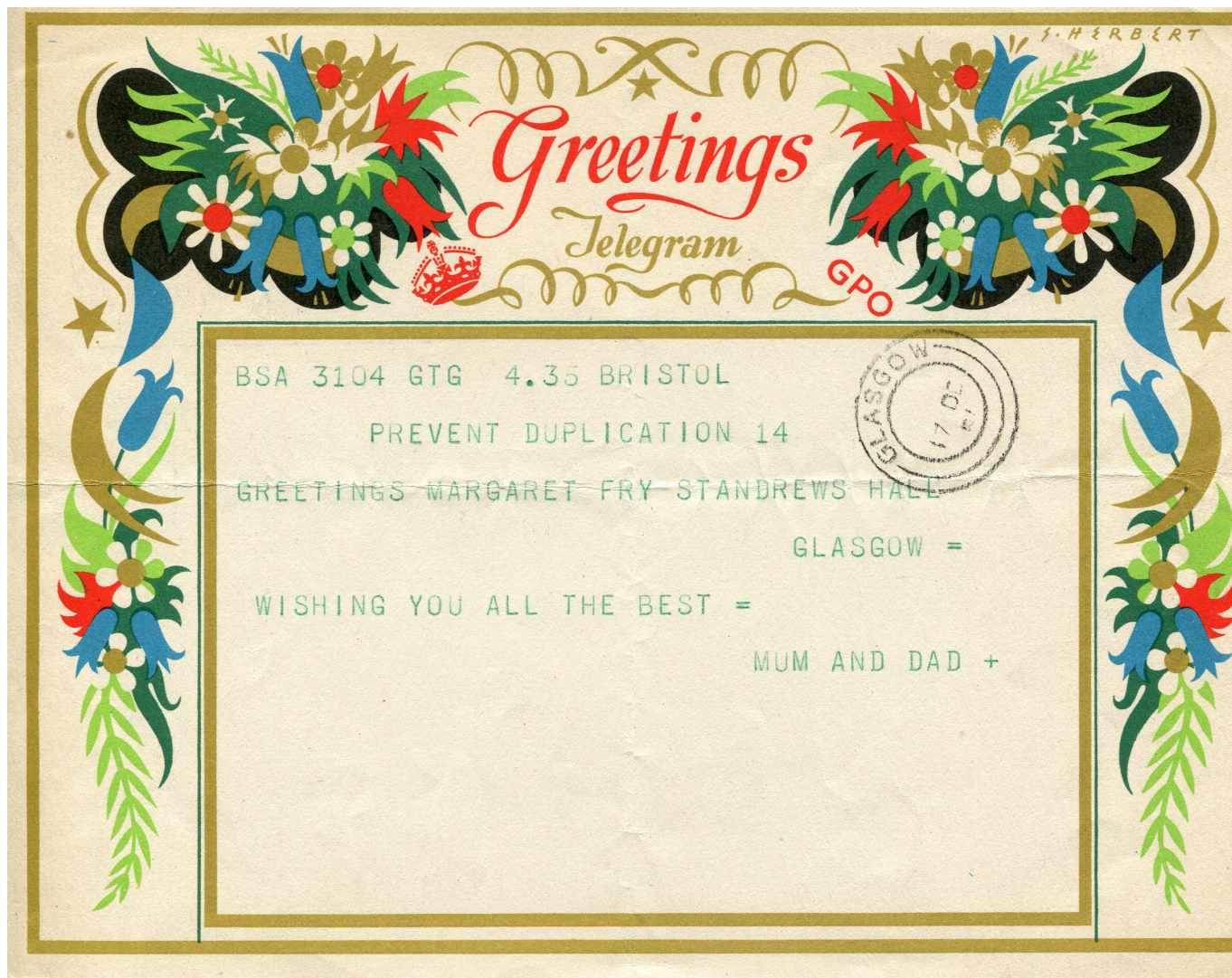
A 'Good Luck' telegram from Mum and Dad.