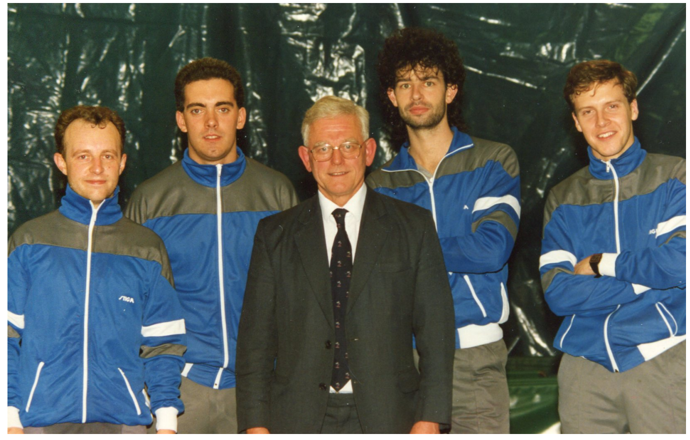
Photo 2 Another team shot but who are they and when and where was this taken?