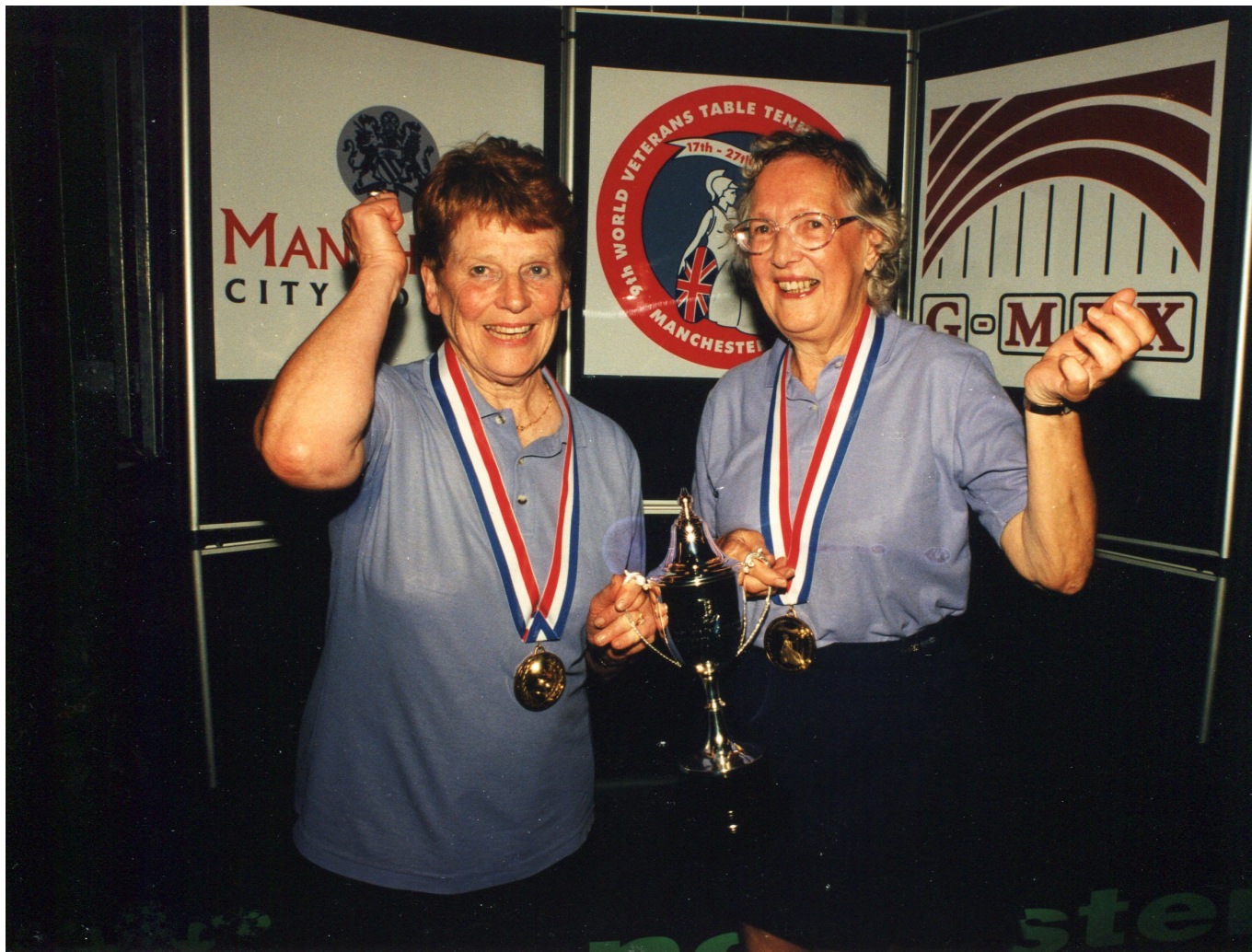
Two lady champions at the World Veterans Championships, Manchester, 1998. Who are they and what have they won?