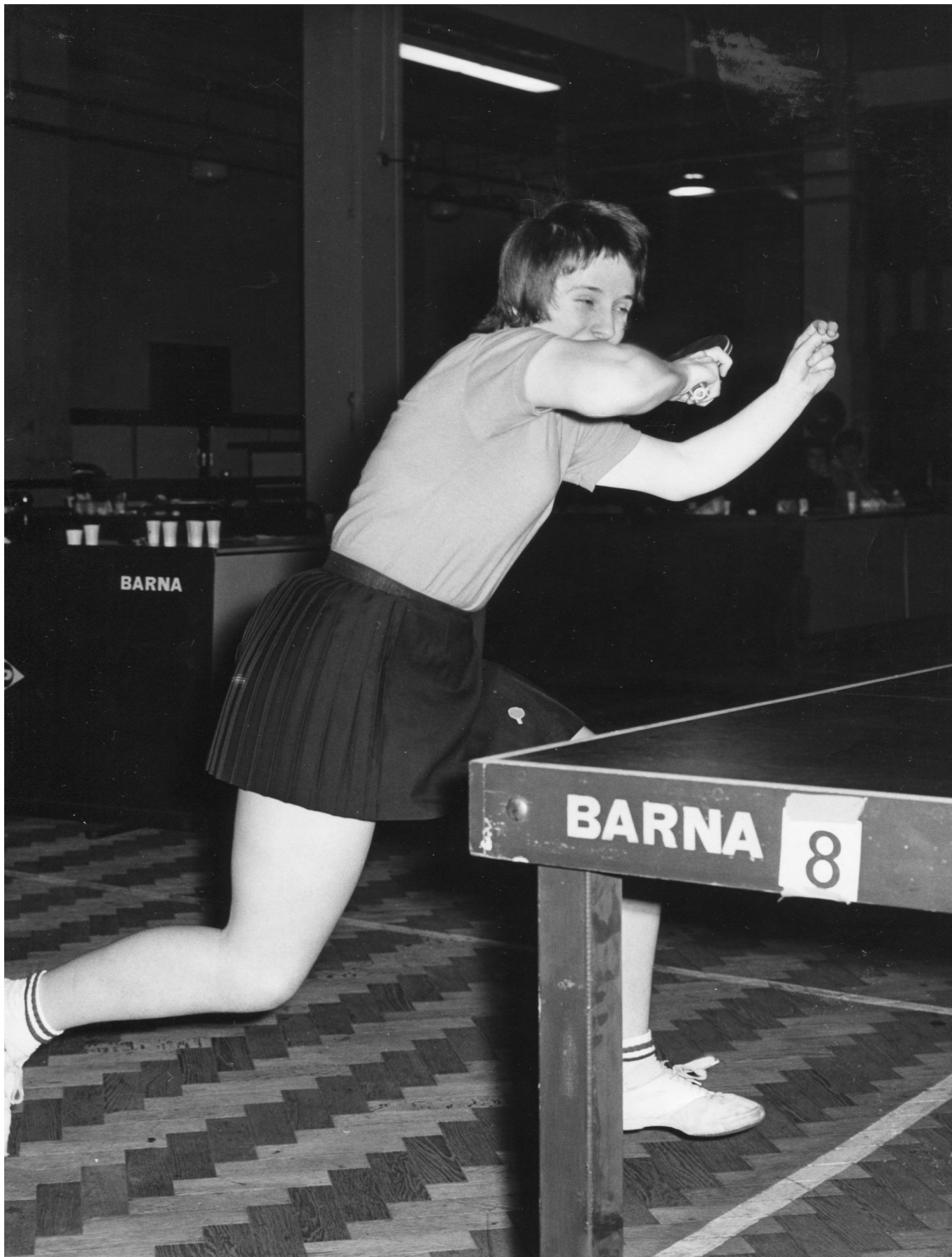
Player unknown