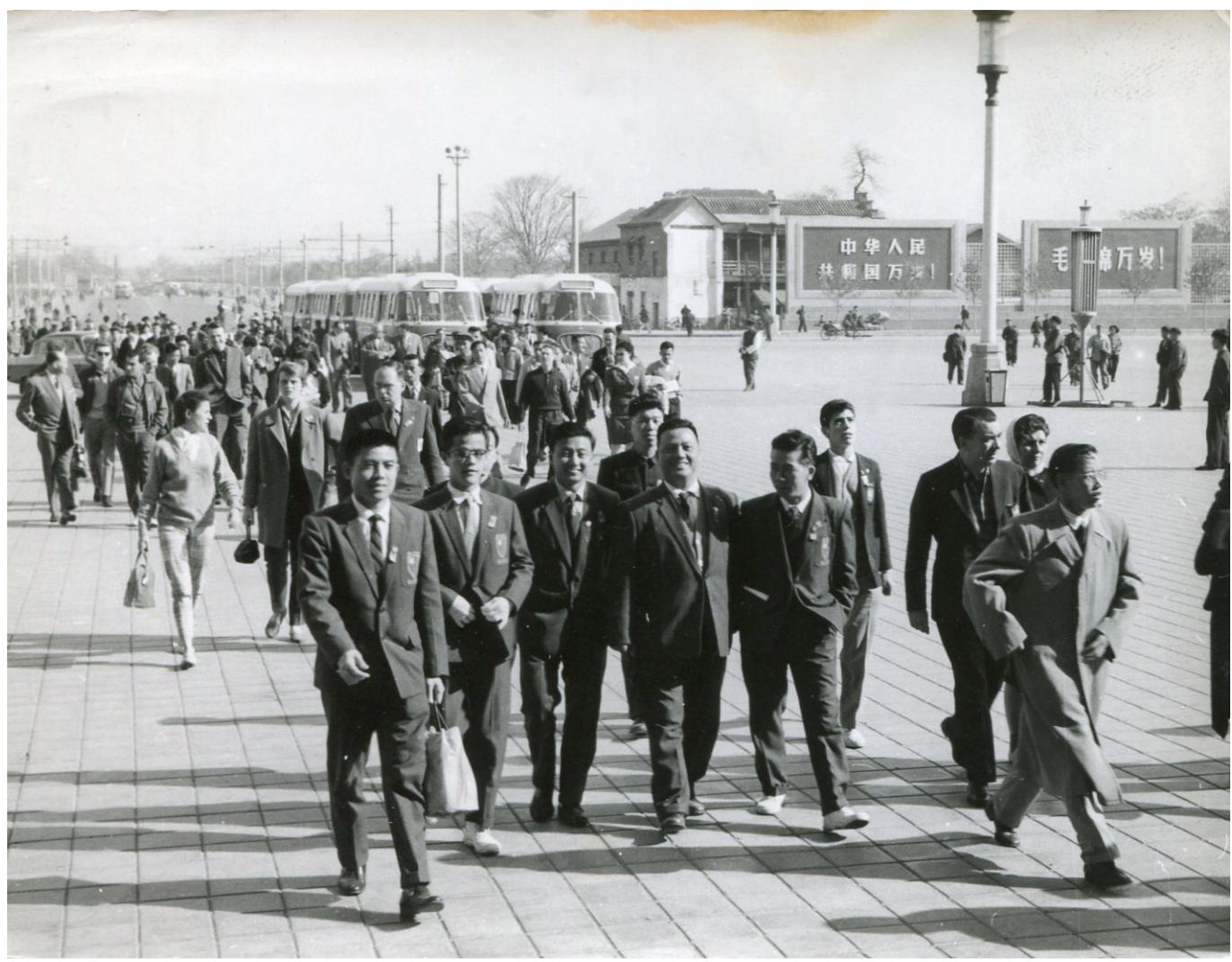
1961 WC players.