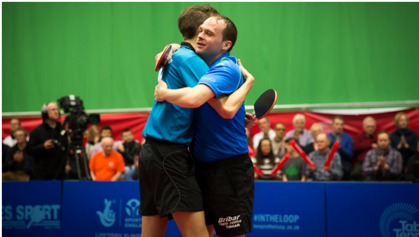
Liam Pitchford & Paul Drinkhall celebrate their victory