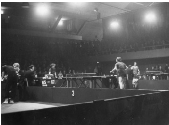
Second round: Helen Elliott (SCO) v Ann Haydon (ENG)