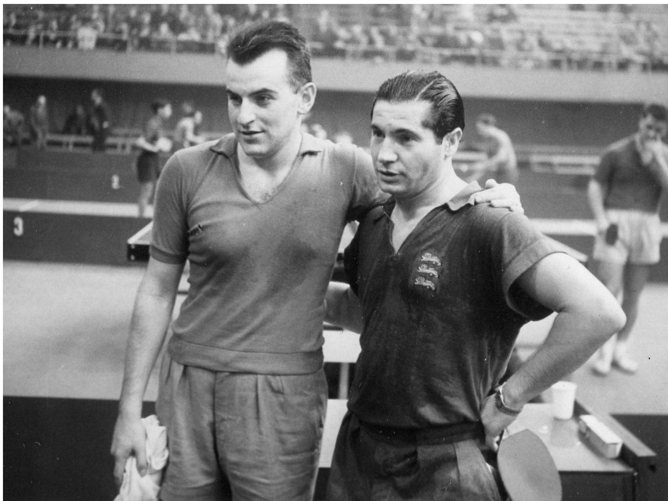
The two players after the match