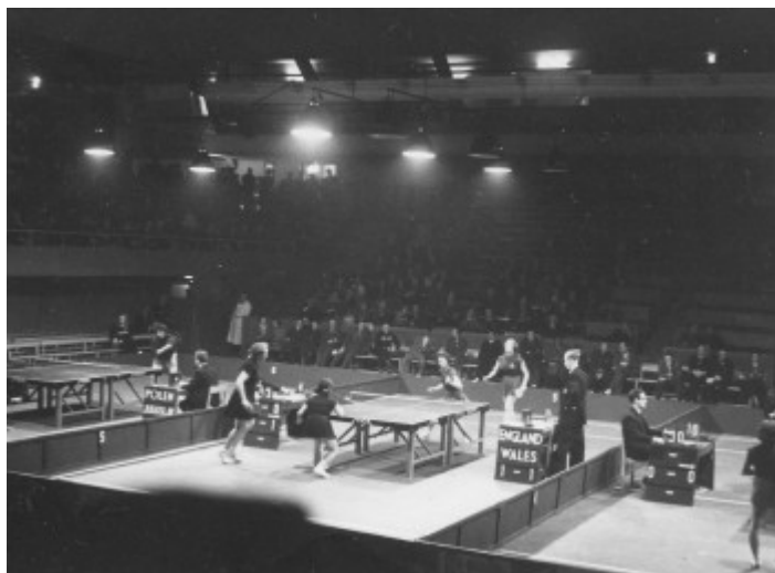
Wales v England: Audrey Bates, Shirley Jones v Diane Rowe, Ann Haydon