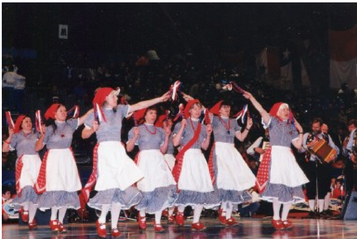
Some of the entertainment