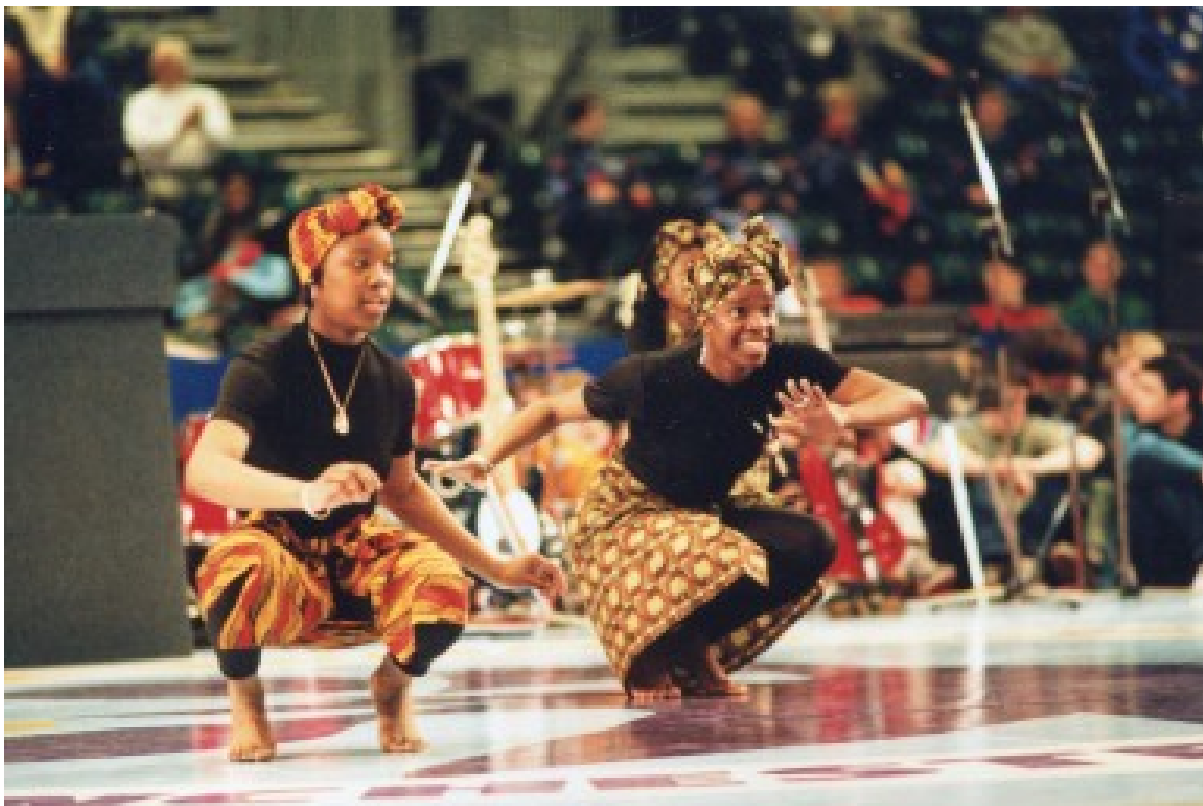
More colorful spectacle