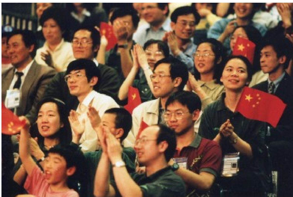
Cheering their winning team.