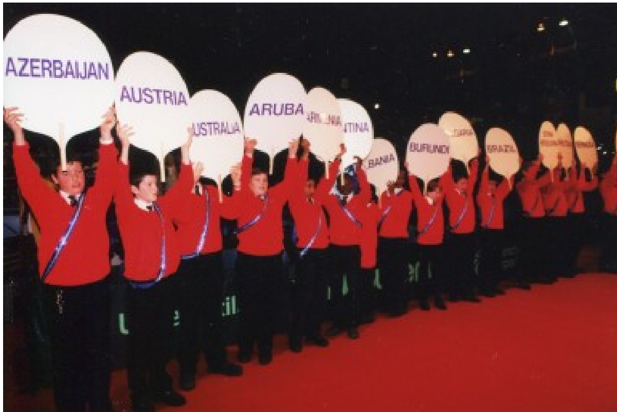
From A to Z