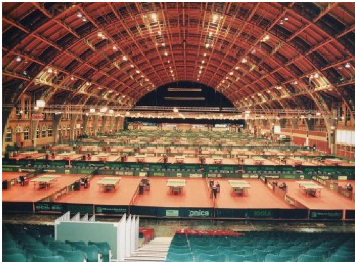
G-Mex Centre, Manchester