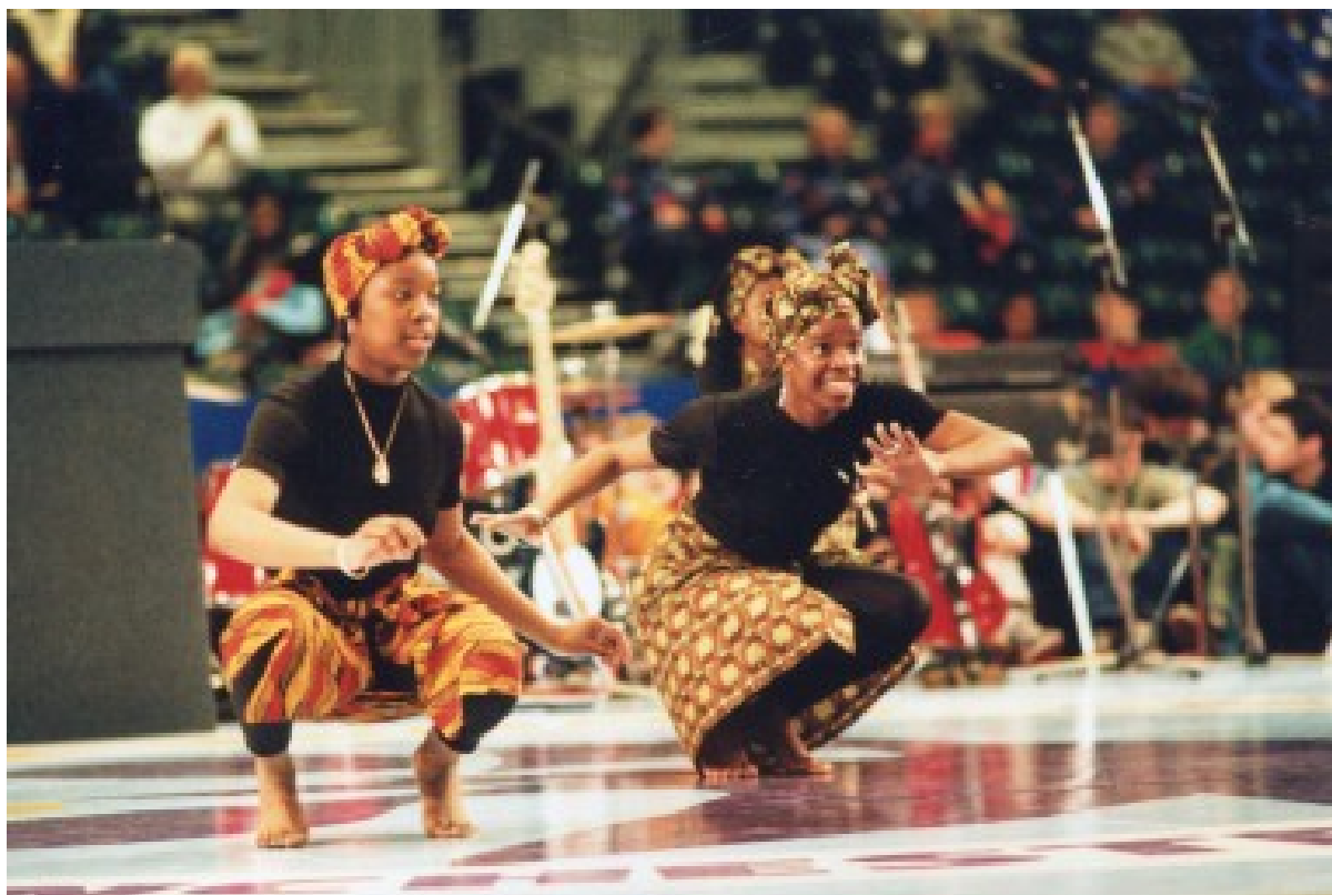
More colorful spectacle