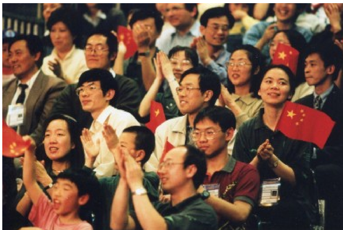
Cheering their winning team.