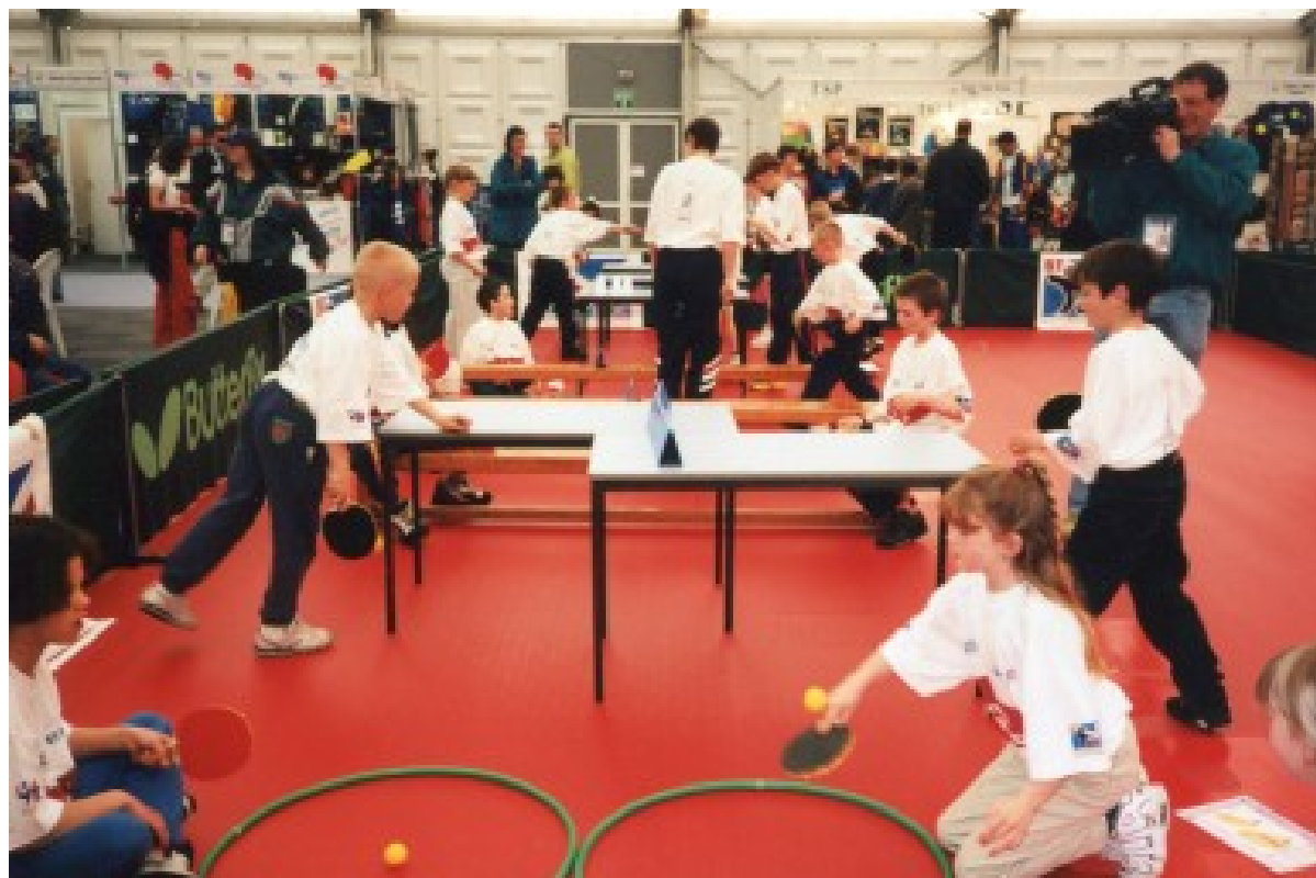
Come and Try