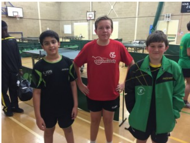
The leading trio from the under-14s