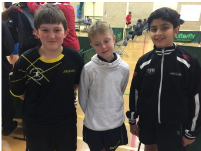
The under-13 top three