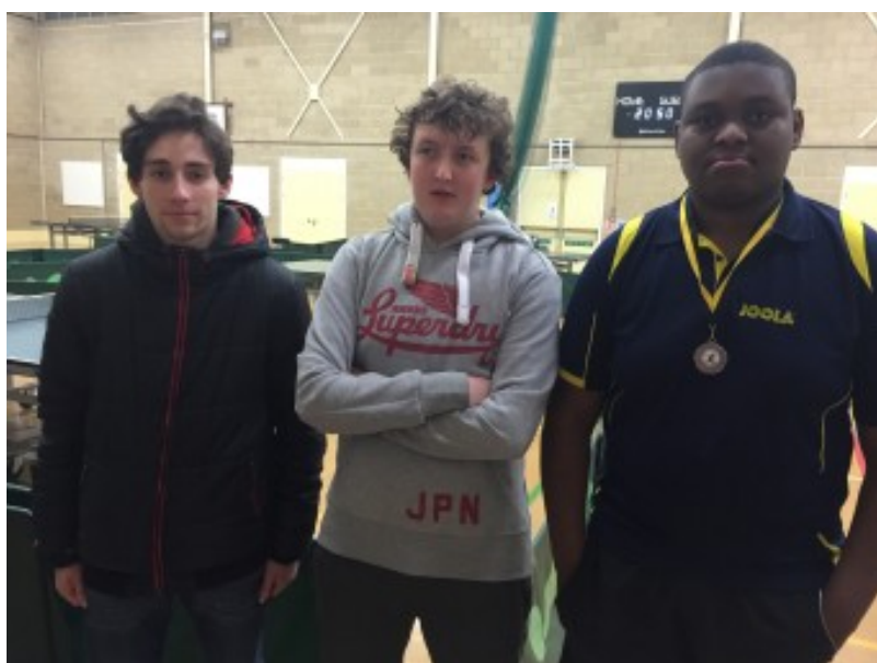
The three under-18 medallists

The largest event saw 29 competitors divided into eight groups. There weren't any seeds defeated in the groups, but three seeds did pull out, paving the way for others.