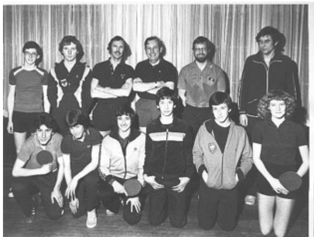
Back Row: Wembley & Harrow Elvin Cup Finalists, 1980.