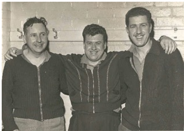
The double winning Wembley and Sudbury Team, 1960/61.