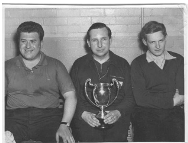
The Elvin Cup Winners for Wembley and Sudbury, 1956.