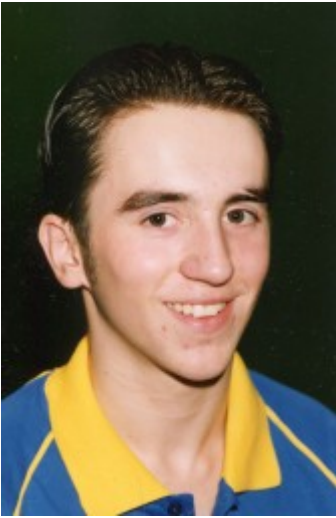
Top 5 England Junior Boy around 1993.