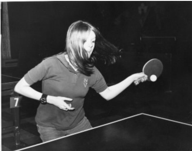
Yorkshire – from Sheffield and if I recall used to play at the YMCA there.