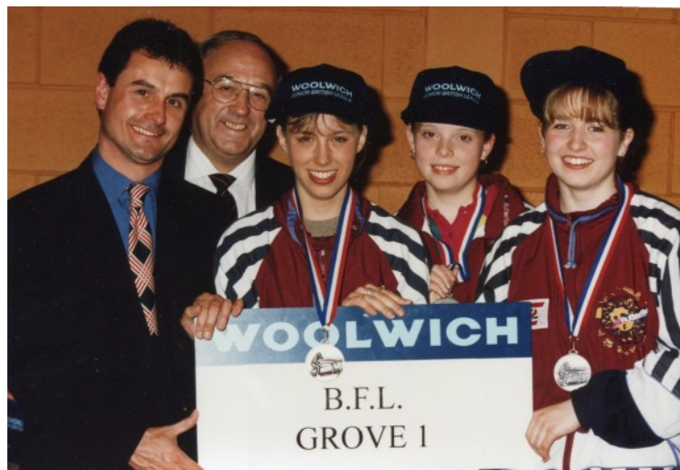
BFL Grove 1 (Girls’ Premier runners-up)