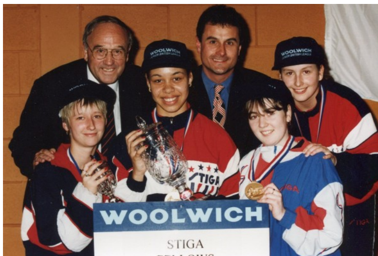
Stiga Fellowes Cranleigh (Girls Premier Winners – equal points with BFL Grove A but winning by one set on count back).