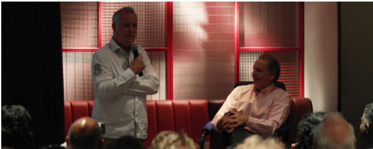
Michael Barrymore takes the stage with 'The Chief'