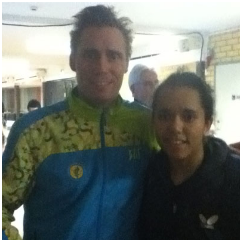
King with Jorgen Persson