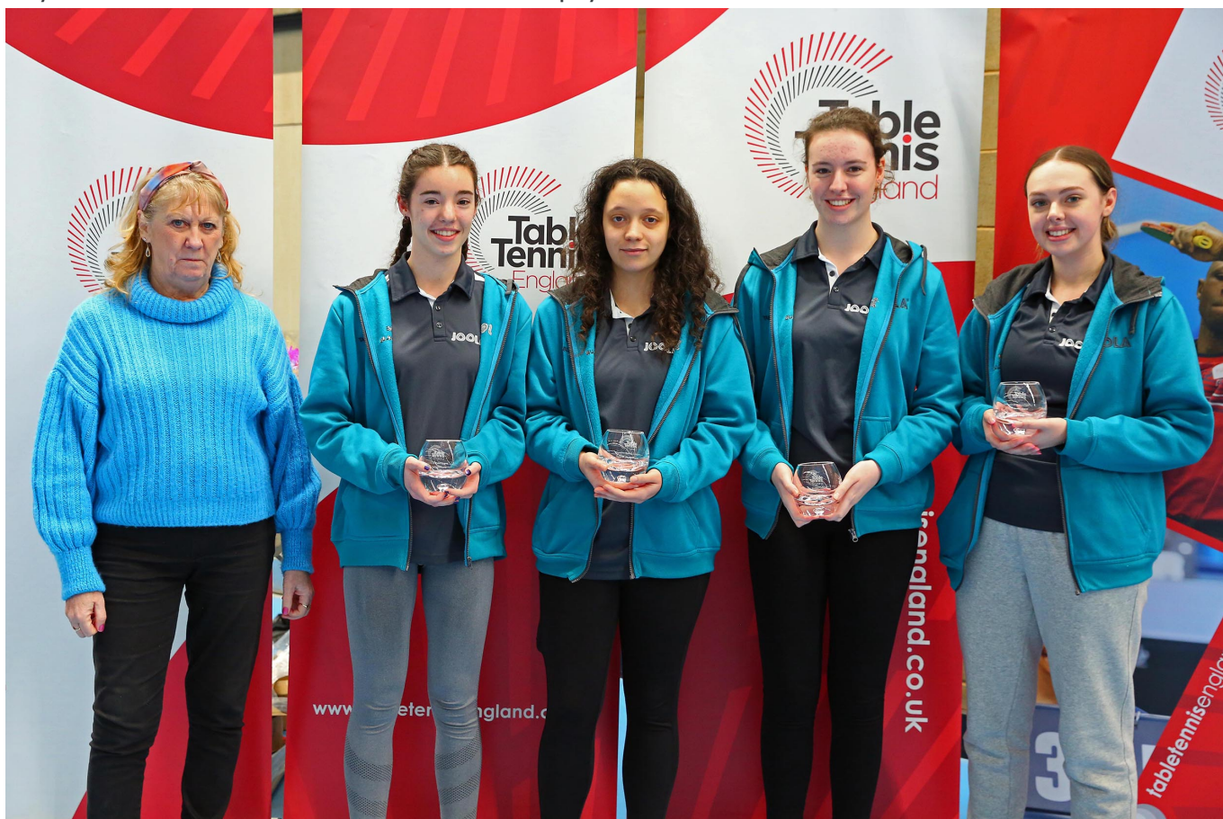
Team of the Weekend Colebridge II