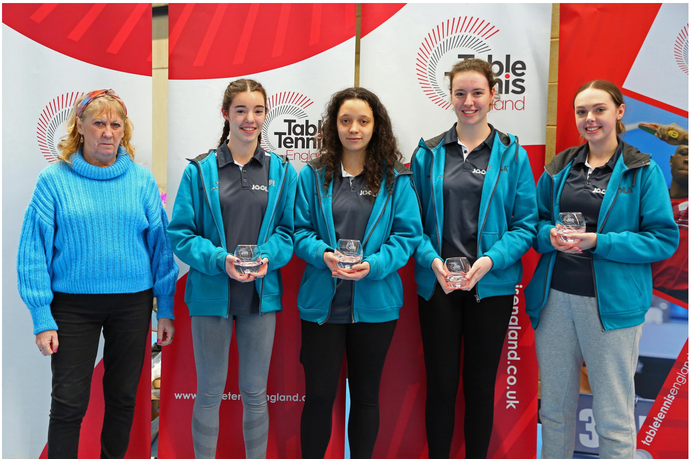
Team of the Weekend Colebridge II