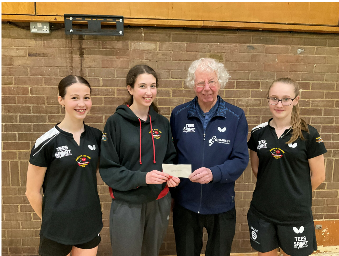
Draycott's Junior Girls' Team champions