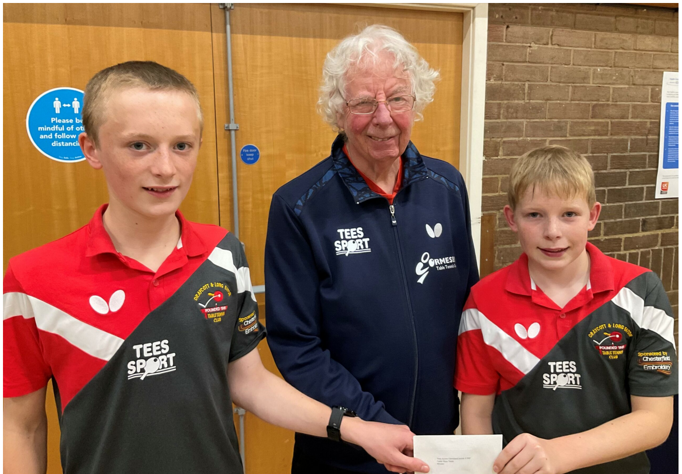
The Cadet Boys' Team winners

In a three-way play-off in the Cadet Girls' Team event, Draycott A won the title with a 3-1 win over London Academy and 3-0 over their own B Team.