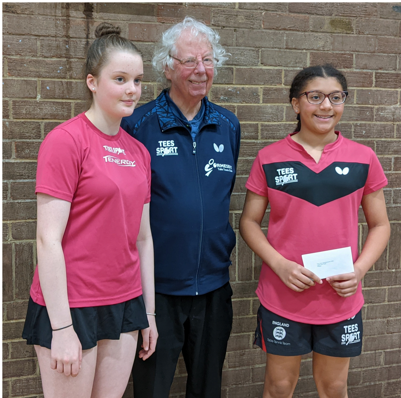
Draycott's Cadet Girls' Team winners