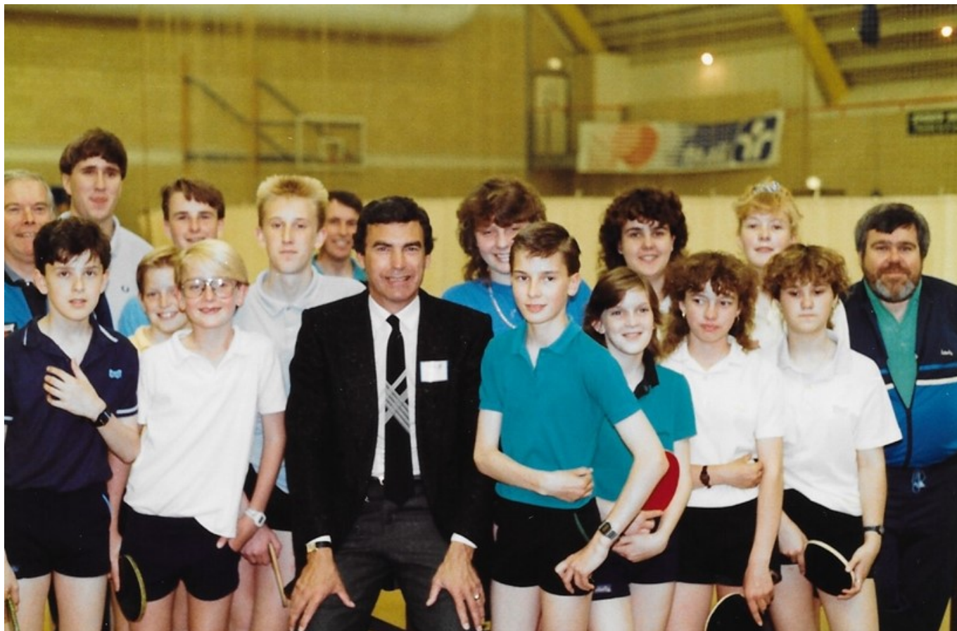
6th July 1988. Chelmsford Riverside Sports Centre, Eastern Region Sports meeting. Trevor Brooking, England & West Ham footballer, at a coaching session.