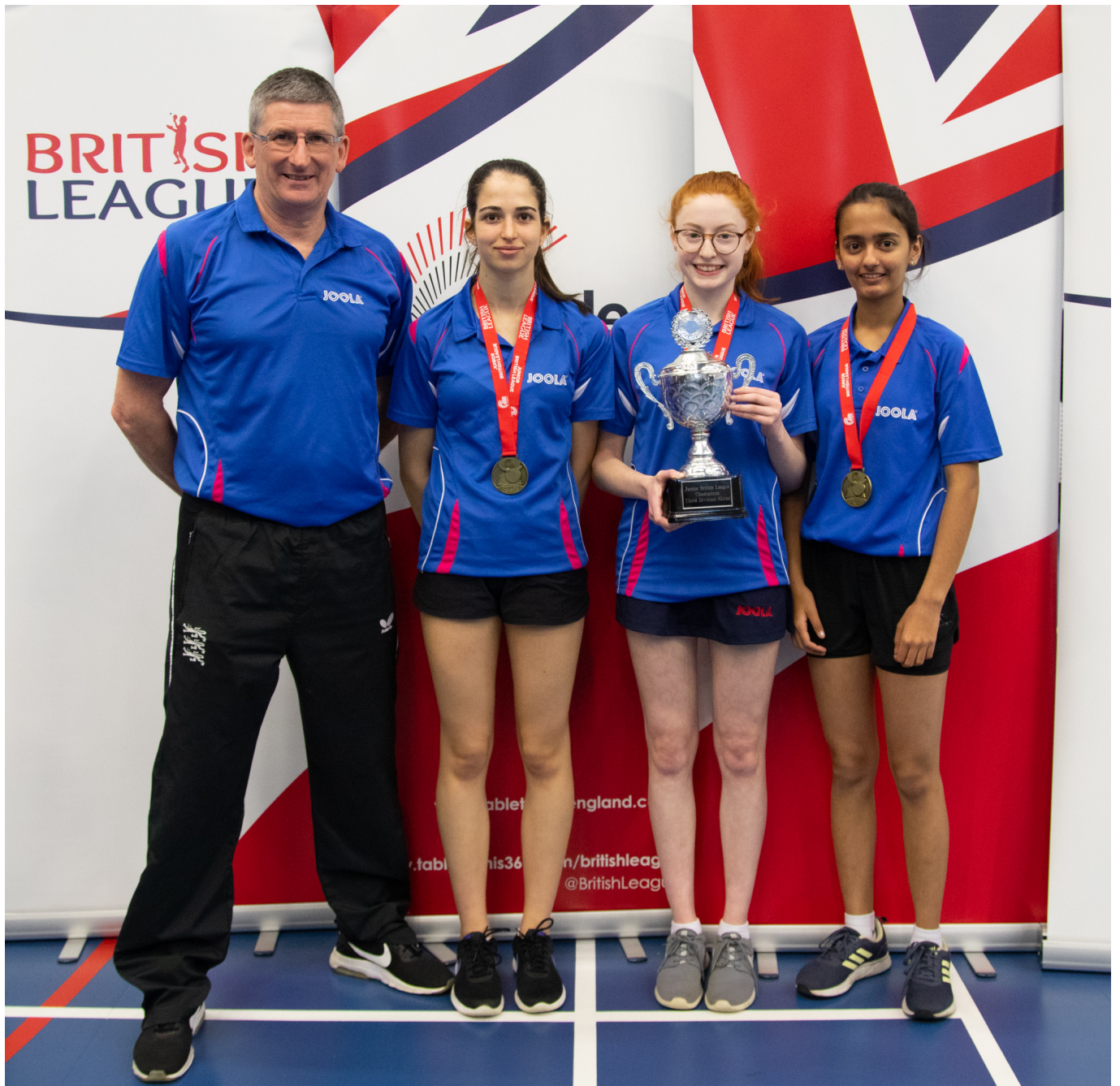
Division 3 winners St Neots

Finally, in Division 3, Cippenham were chasing St Neots for the title, with just two points between them at the end of weekend one. They managed to close the gap after starting the second weekend with four straight wins, while St Neots had three three wins and one tie. It meant there was all to play for in the final match of the day – which saw these two teams go head-to-head. After ending with a 3-3 tie, it meant that St Neots had managed to cling onto the title with just a one point lead.