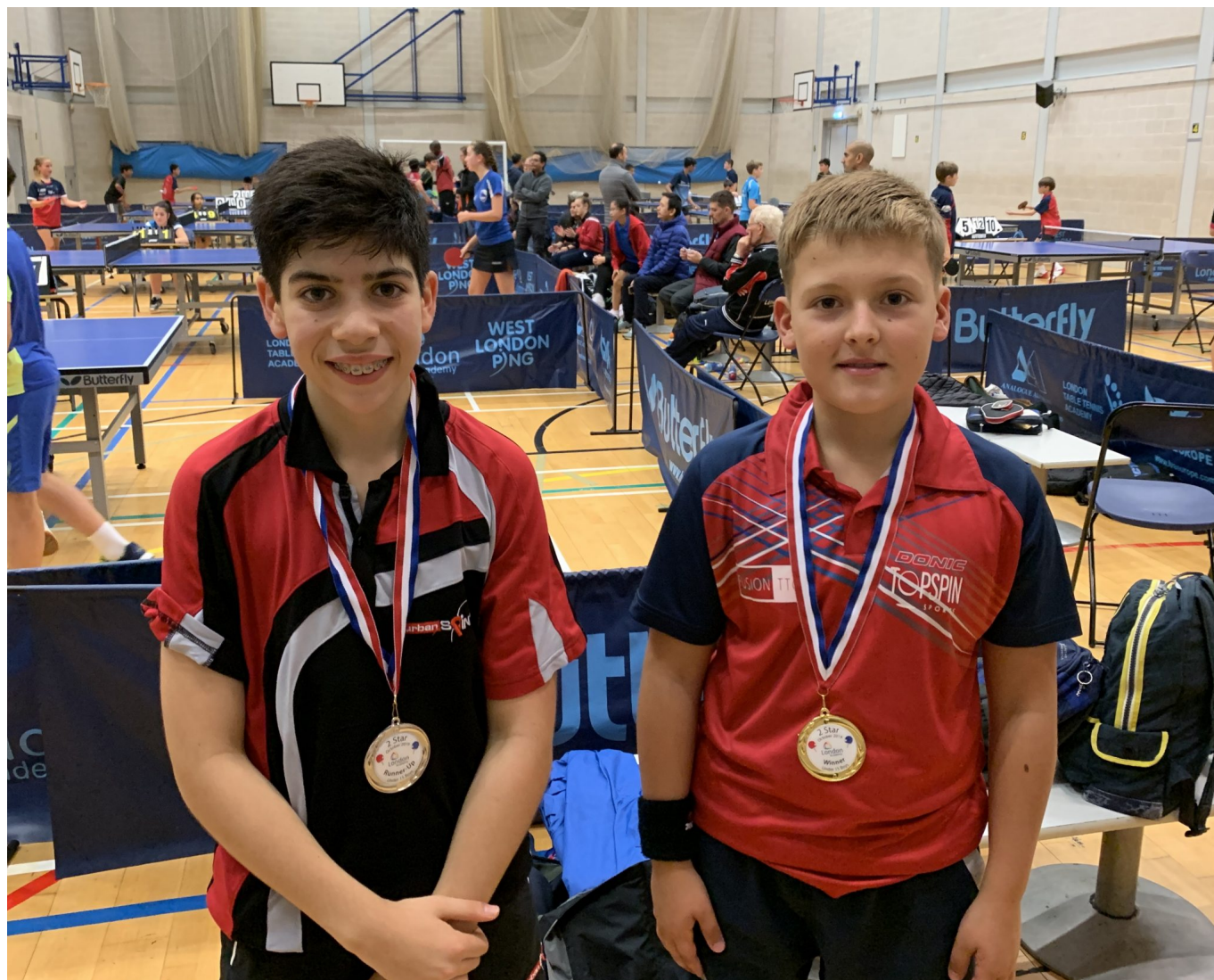
The top two in the U15 Boys