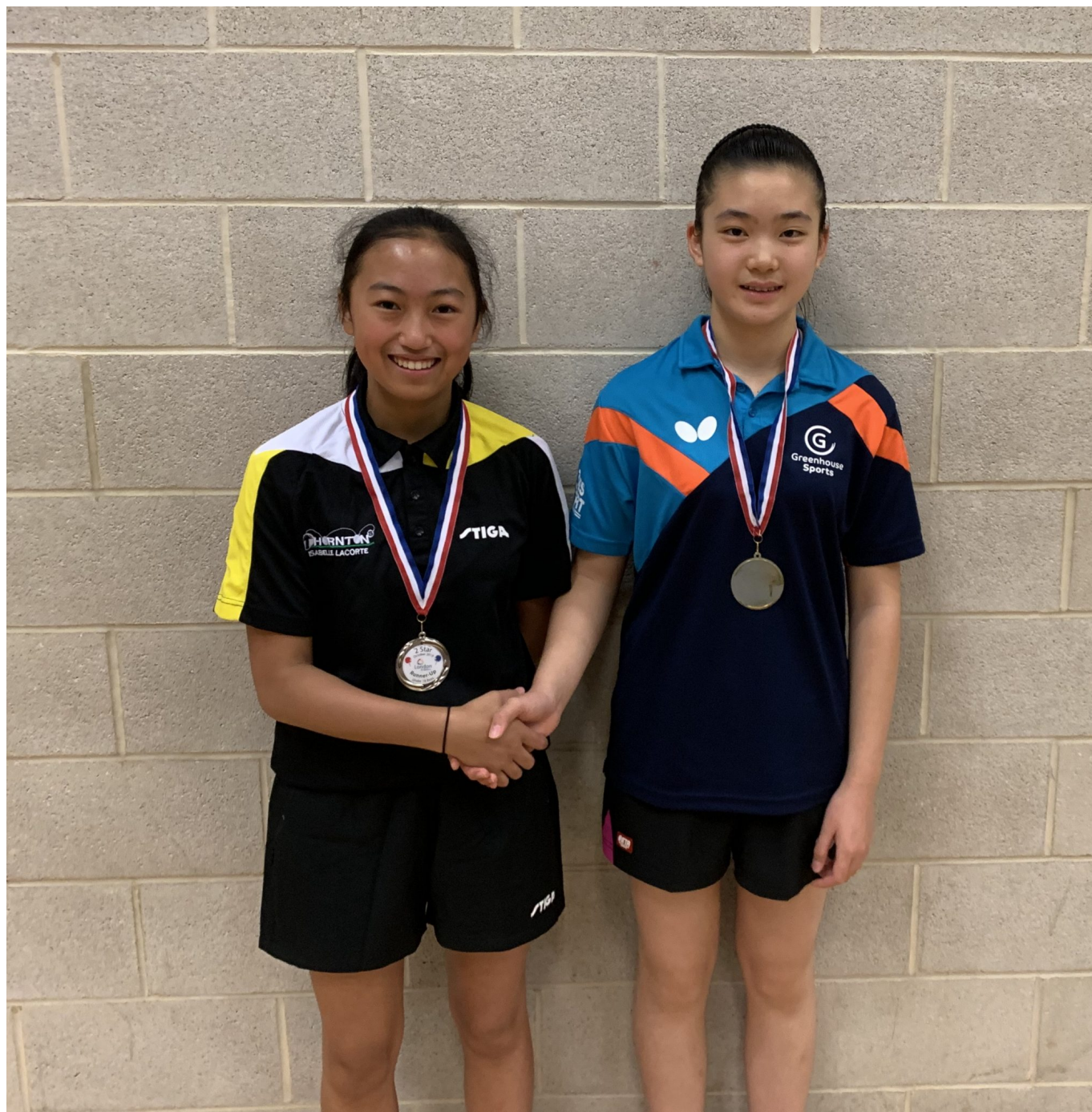
The U15 Girls medallists