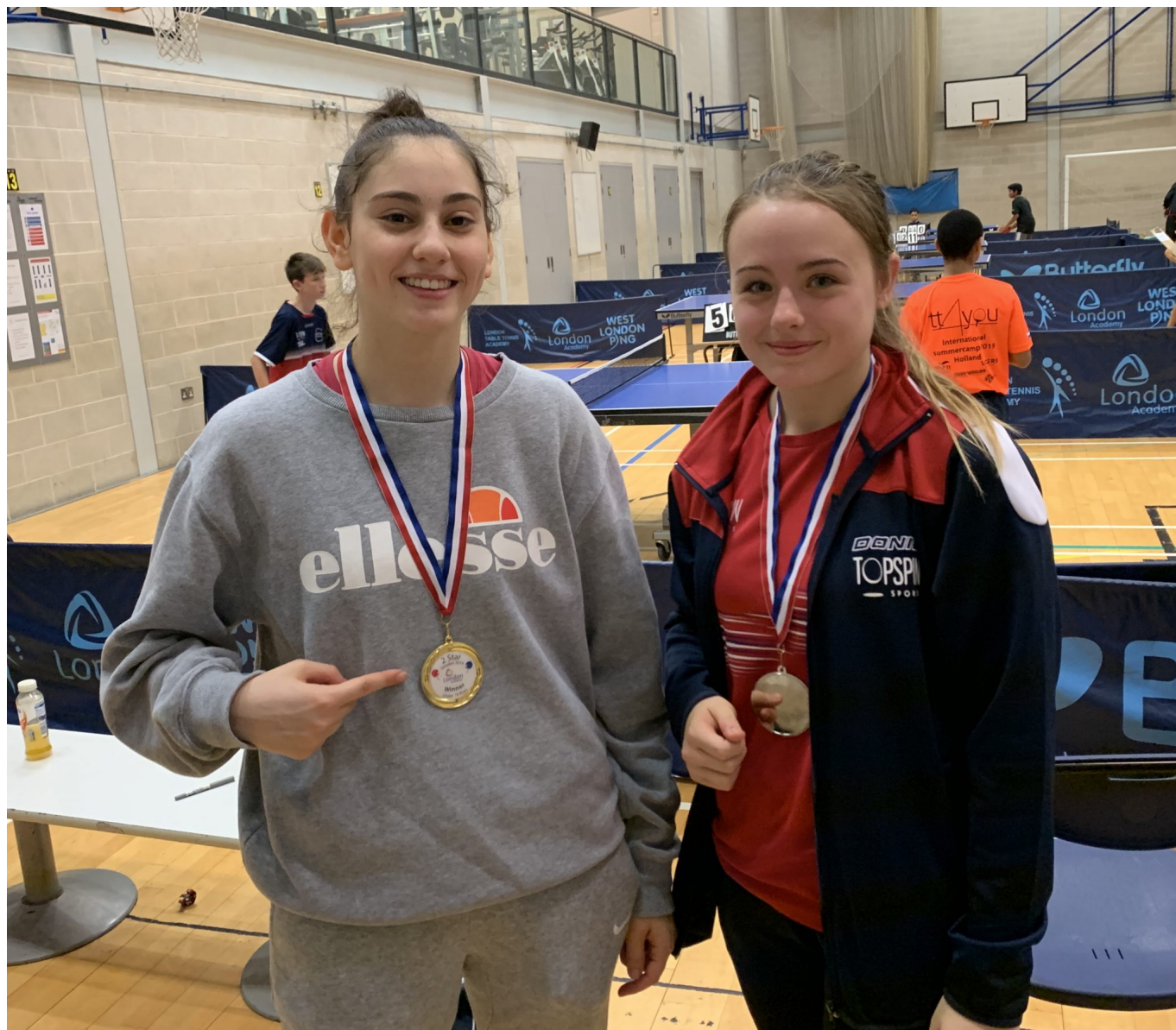
The U18 Girls top two