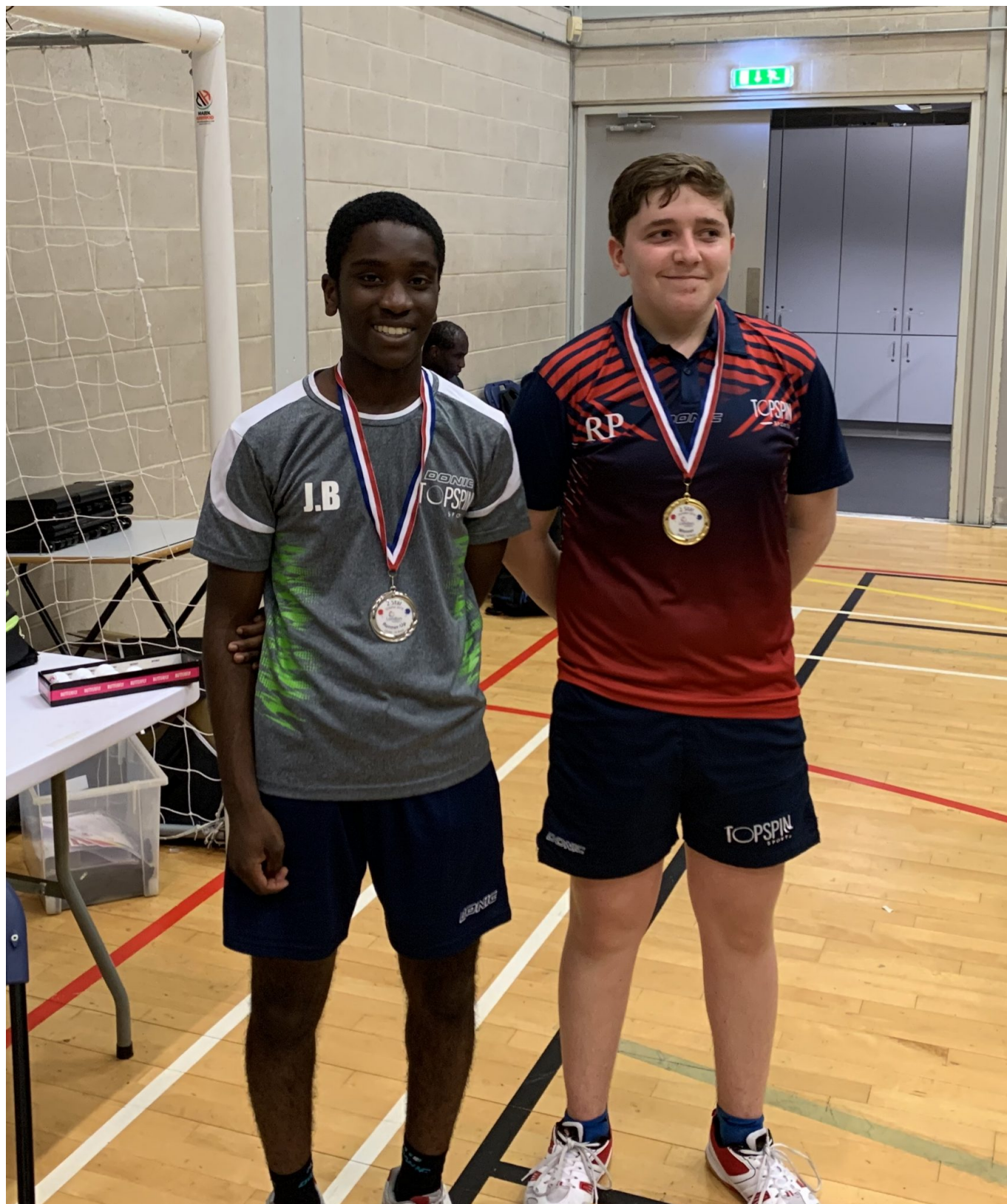
The U18 Boys medallists