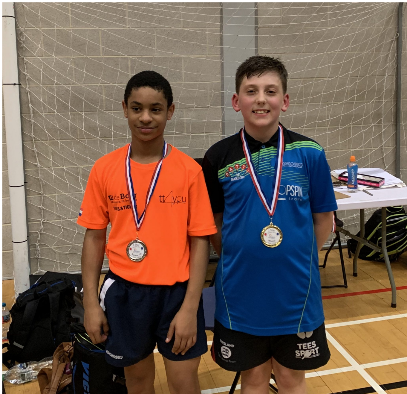
The two medallists in the U13 Boys