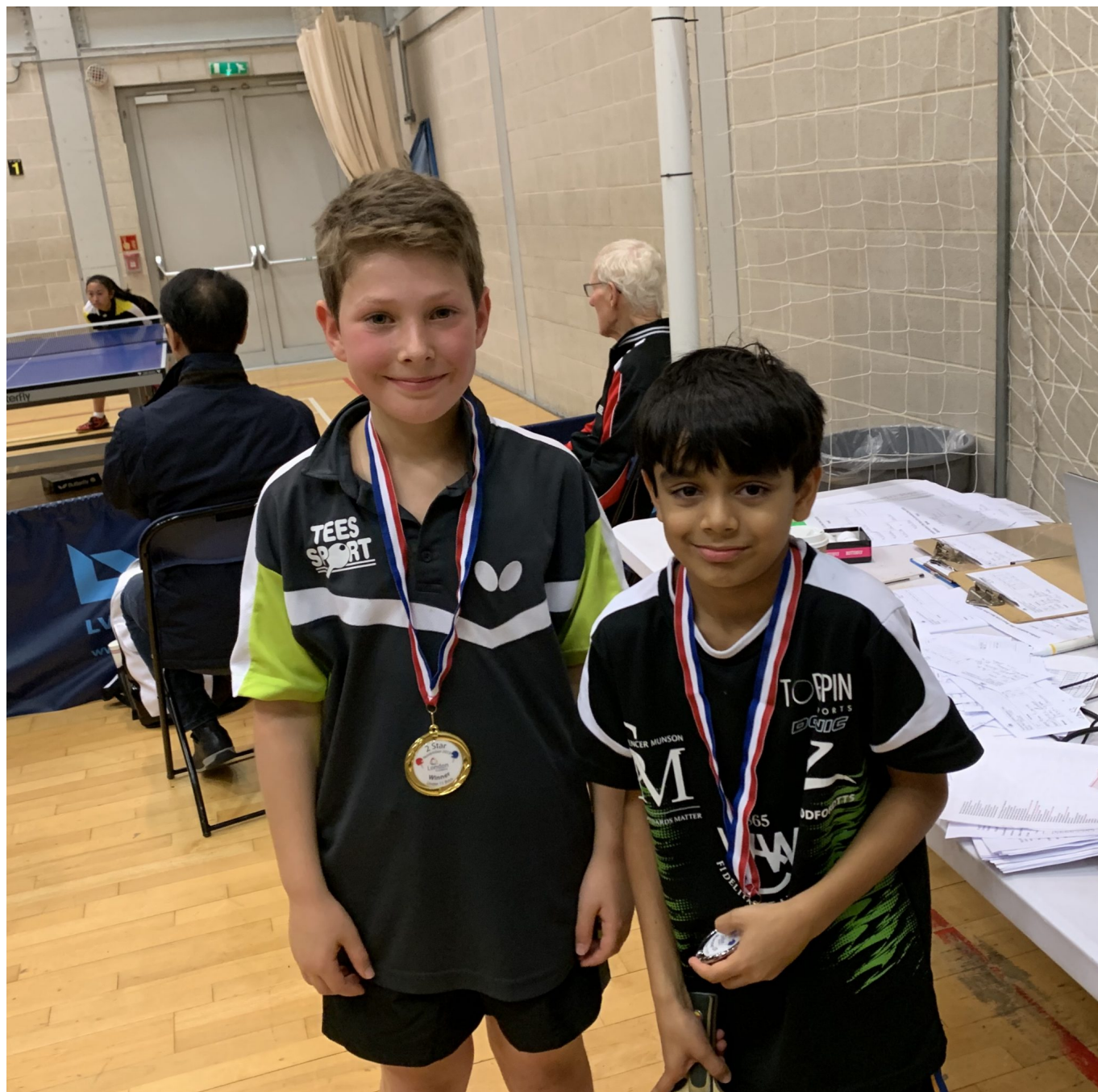
The U11 boys medallists