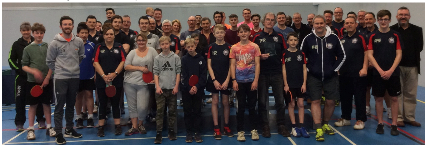
South West Club of the Year Portishead TTC