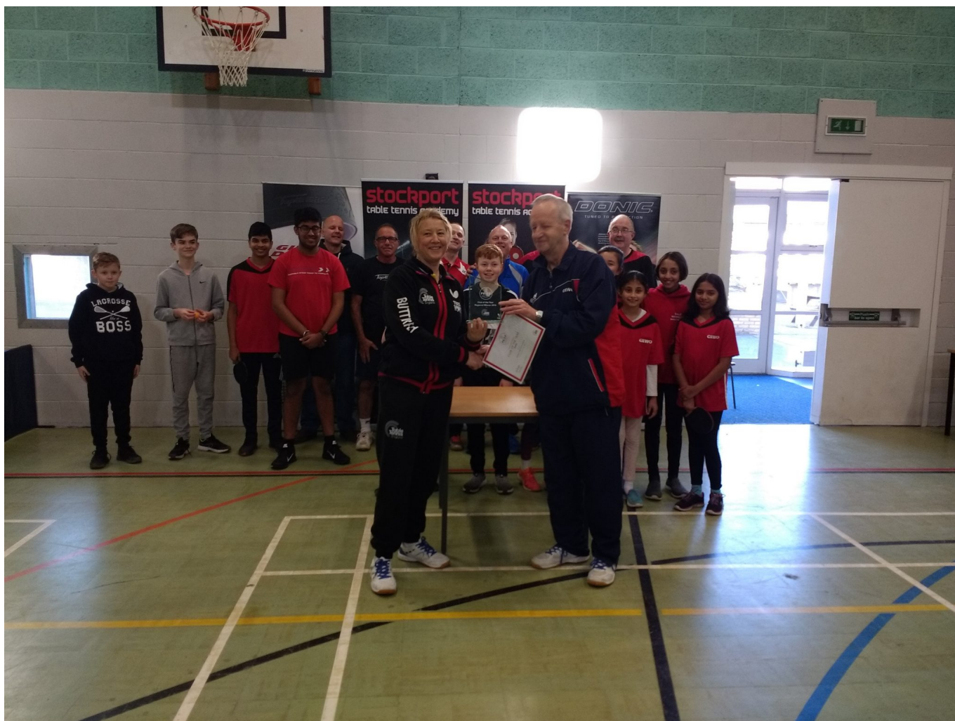
North West Club of the Year Stockport TT Academy

Some of the presentation pictures are shown below: