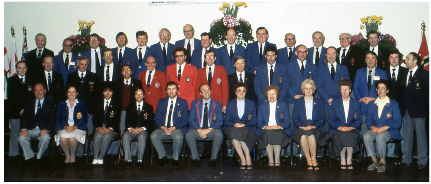
The tournament officials