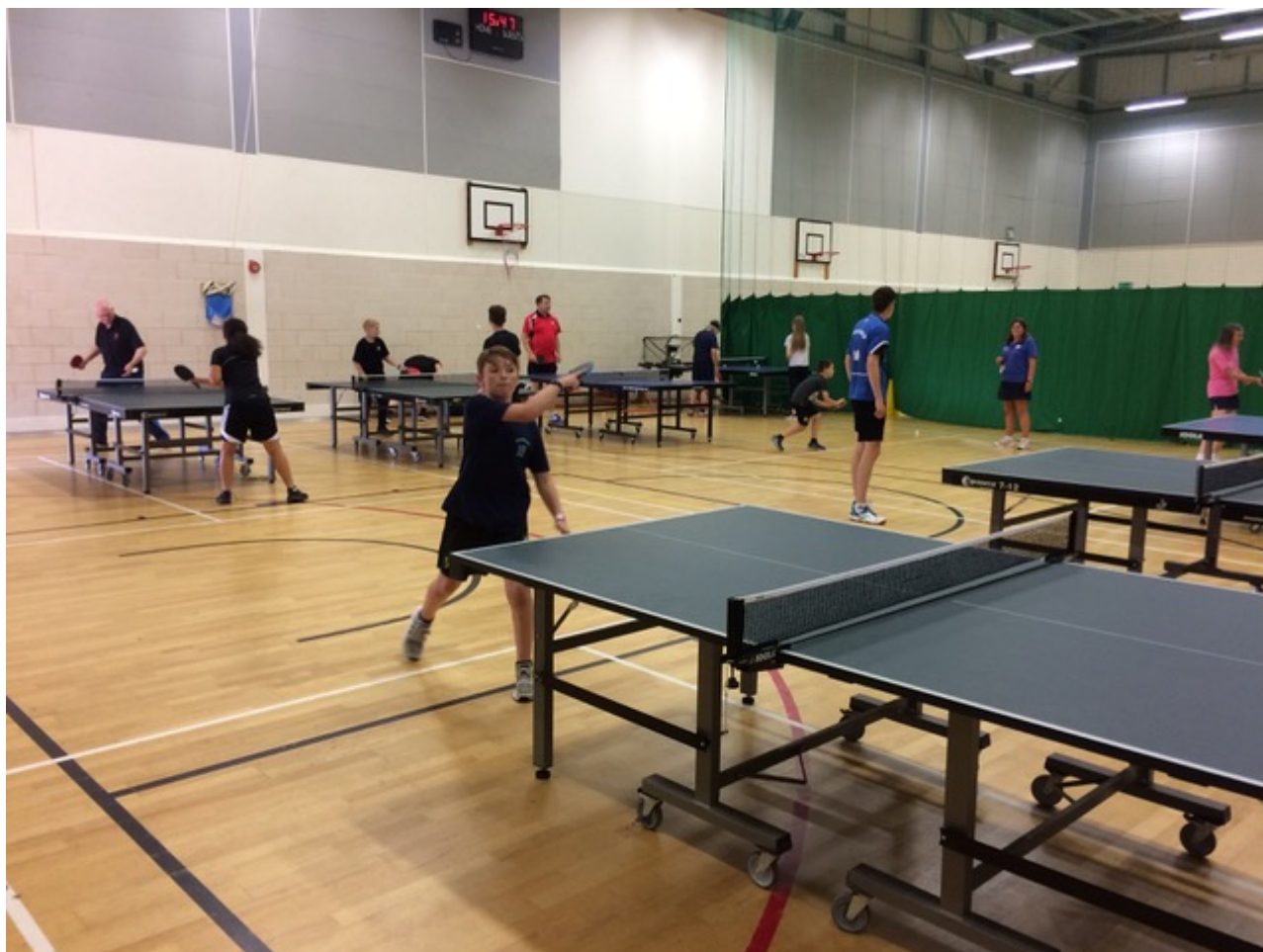
Action from an event at Dane Court Grammar School in Broadstairs: