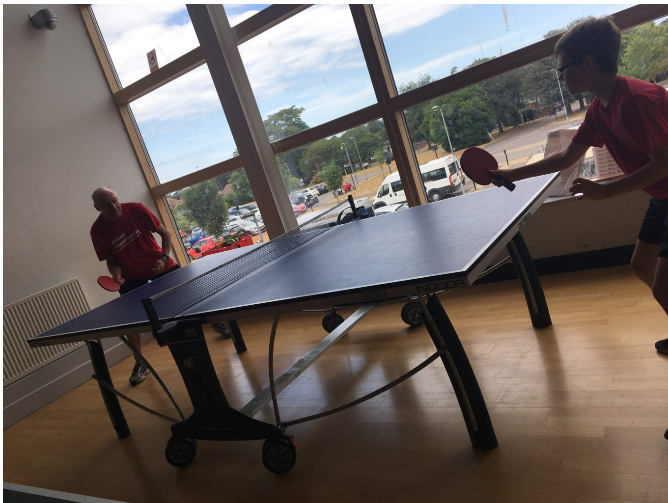
And from Leeds Grand Mosque: