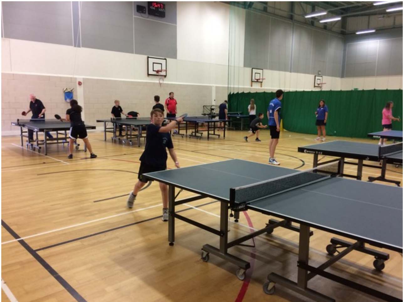
Action from an event at Dane Court Grammar School in Broadstairs: