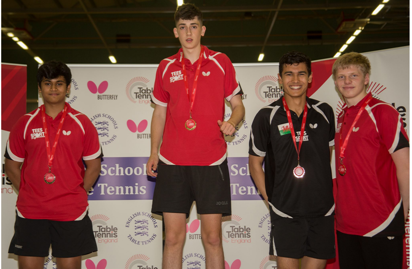
The Senior Boys' podium