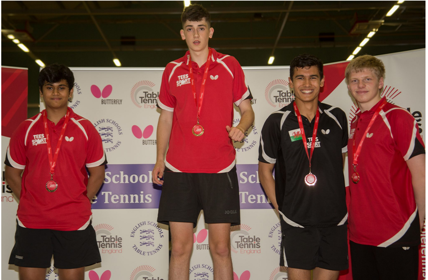
The Senior Boys' podium