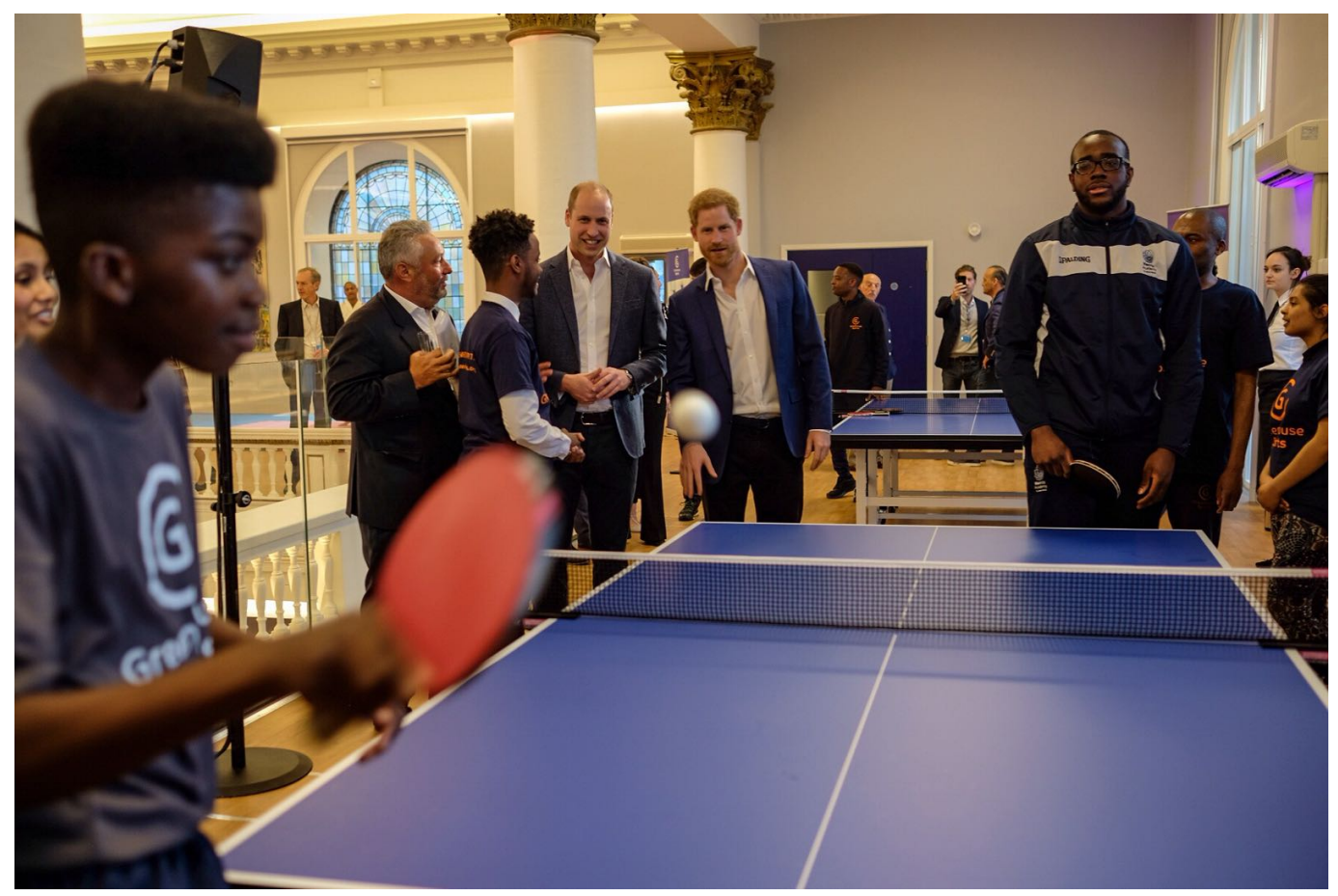
The princes at last night's opening

The Greenhouse Centre is the new home of Greenhouse Sports, a London-based charity that uses sport to engage young people and improve their life chances. Table tennis tables have replaced wooden pews but the stained-glass windows and columns remain at Christ Church Cosway Street, a Grade II* listed deconsecrated church in north-west London.