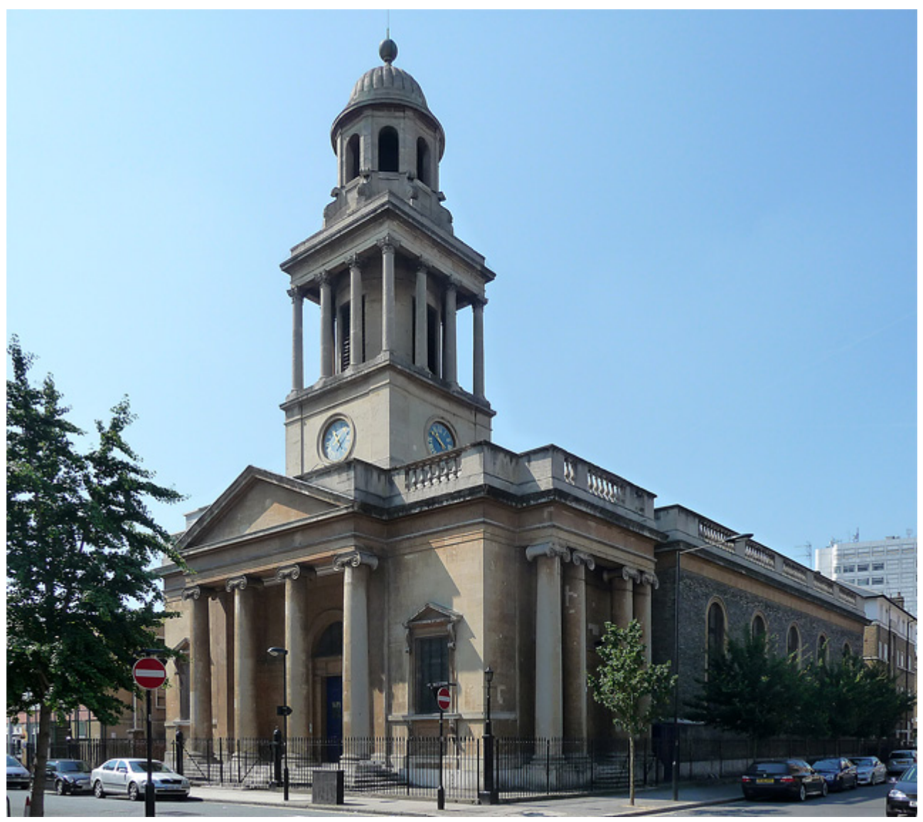
The building in Cosway Street

Greenhouse Sports acquired the listed, deconsecrated church in 2014 and worked painstakingly with architects and contractors over two years to create a state-of-the-art, accessible sports centre with all the latest technology.